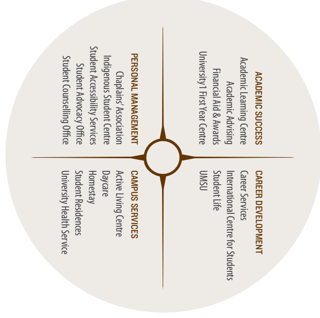
This circular model is rooted in Indigenous culture and shows the interconnectedness of development and success.

WE ARE HERE TO HELP The university wants you to succeed in all areas of your life! Visit these resources and help centres: