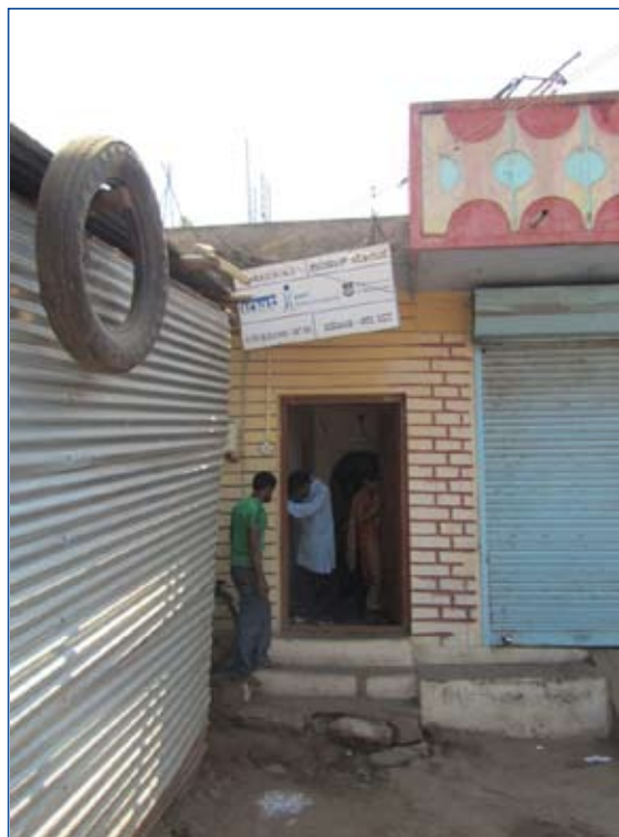
Karnataka, India: HIV/AIDS Outreach Centre

The entire international learning experience in India was valuable. Working as international groups, within an international context, coming from interdisciplinary academic contexts, learning side-by-side, eating Indian food (with the occasional western KFC meal or pasta dish provided by KHPT for those who missed their North American diets), visiting temples, shopping in bazaars, laughing at monkeys as they clamored on vehicles, looking in awe at the elephants and cows that walked by, and most importantly having the opportunity to spend time with people working with, living with and affected by HIV/AIDS. This unique training offered an experience none of us will soon forget.