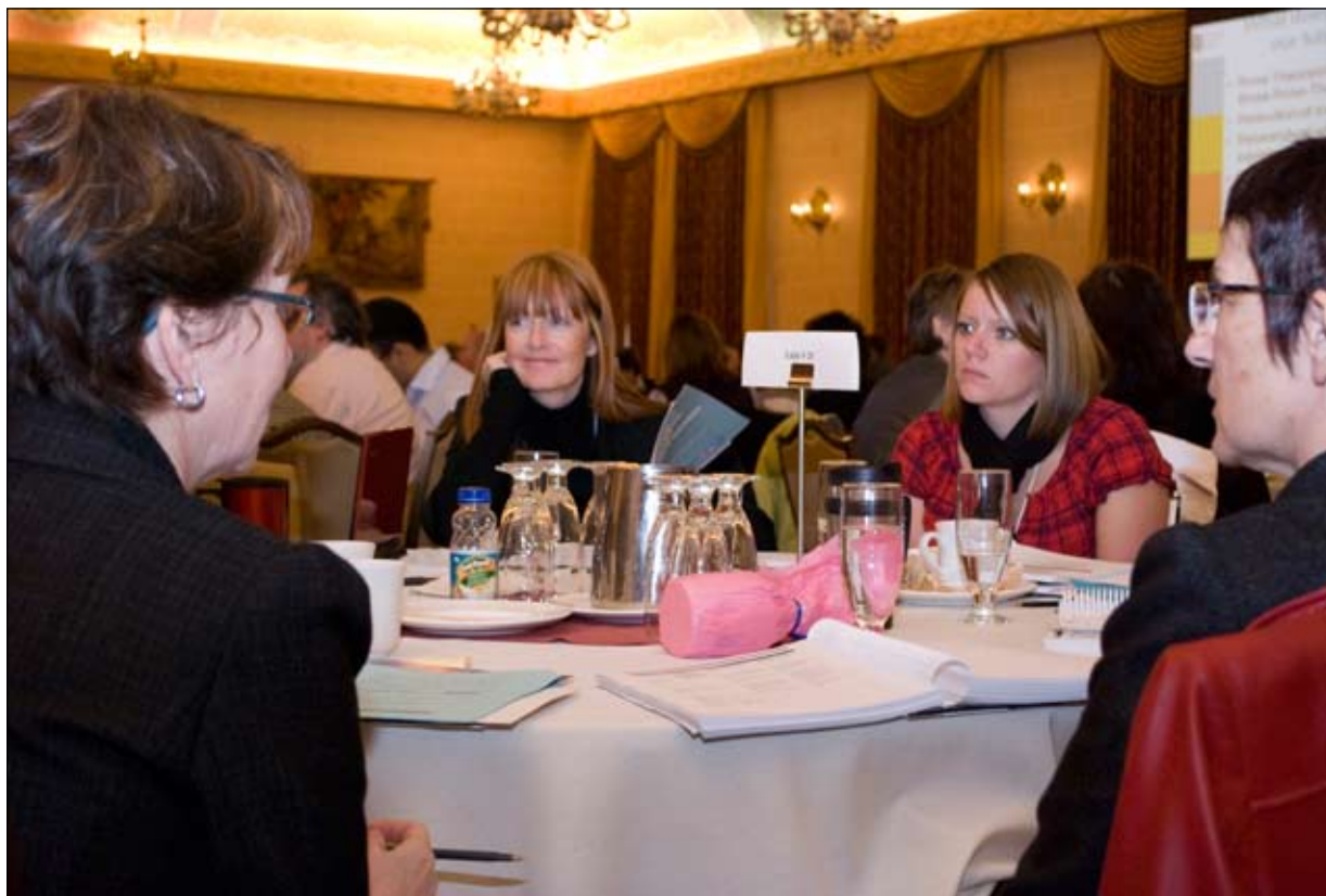
17th Rural Workshop, 27 October 2010

The one-day event will feature the report, "Health Inequities in Manitoba: Is the Socioeconomic Gap in Health Widening or Narrowing Over Time?" Like similar events for Manitoba Health and the rural and northern health authorities, facilitated roundtable discussions will follow the keynote presentation. As a part of the agenda for the afternoon, MCHP researchers will provide an overview of other research projects in various stages of completion.