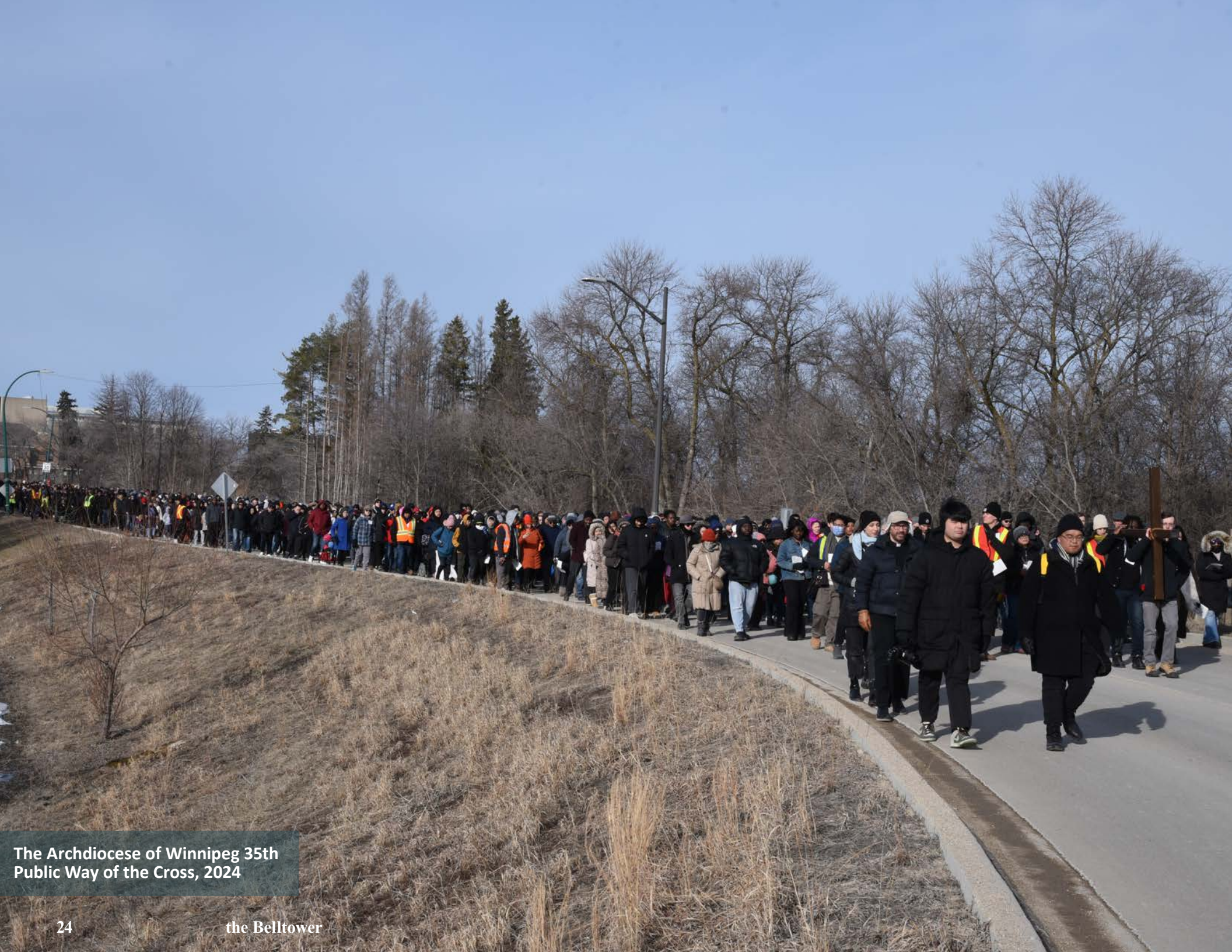
The Archdiocese of Winnipeg 35th Public Way of the Cross, 2024