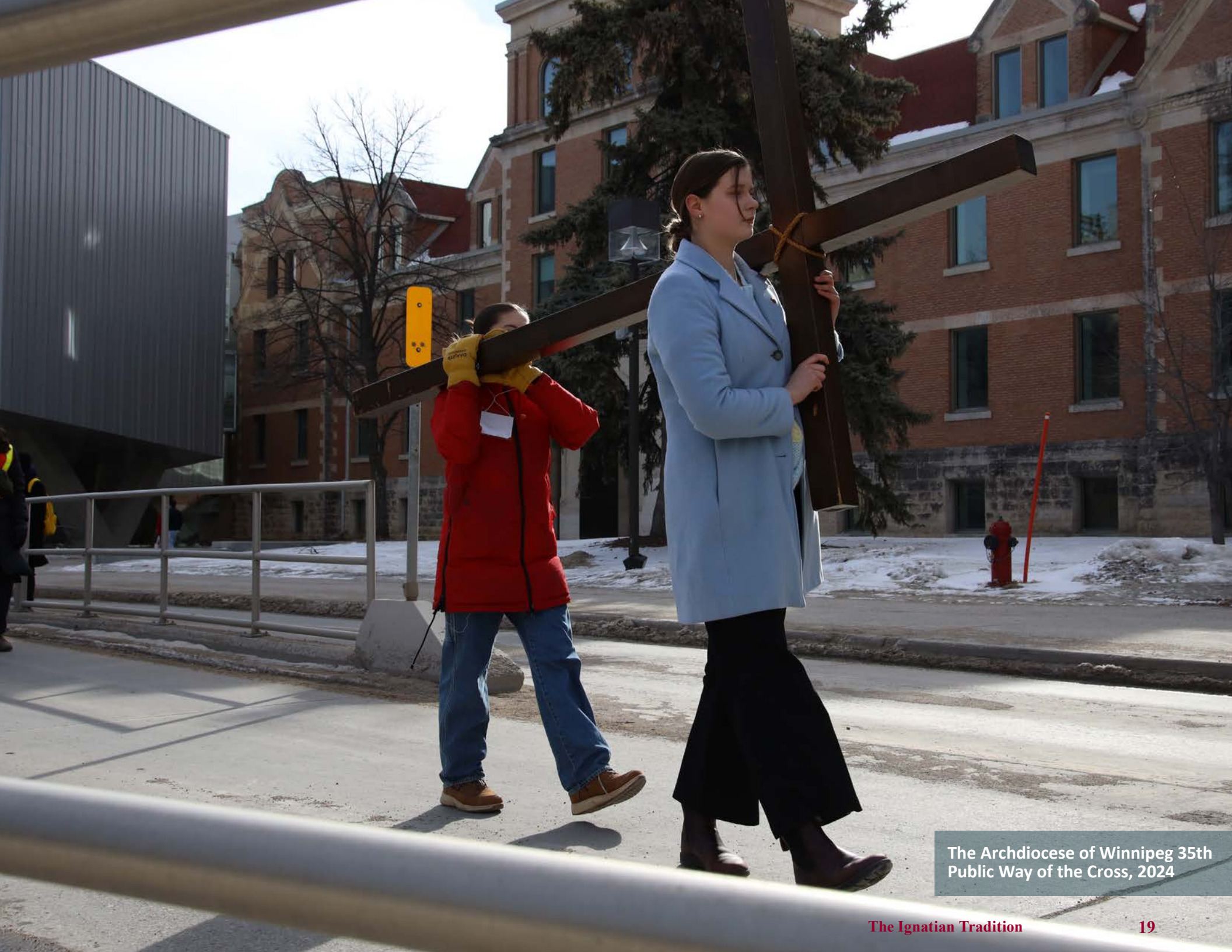
The Archdiocese of Winnipeg 35th Public Way of the Cross, 2024