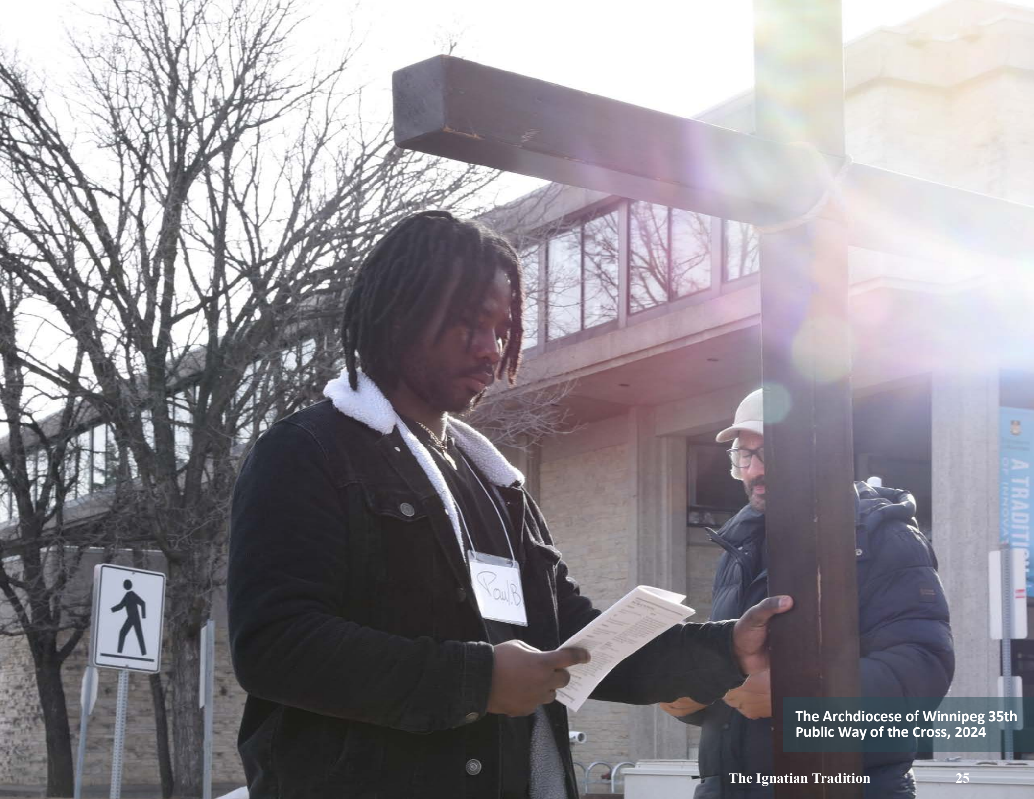
The Archdiocese of Winnipeg 35th Public Way of the Cross, 2024