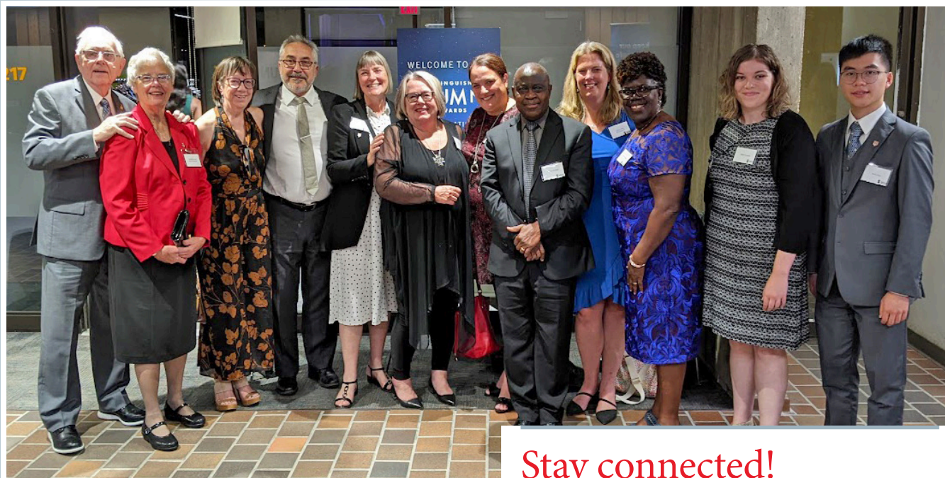
Group photograph of SJC staff, alumni, and students at the Alumni Homecoming Banquet

Last September the College was happy to welcome some of our alumni to the Annual University of Manitoba Homecoming Celebrations and Alumni Awards. The Homecoming Celebrations are a time-honoured tradition that brings everyone connected to the University (staff, students, faculty, alumni, and friends) together to celebrate what it means to be part of the University of Manitoba community. For us at SJC, we took the opportunity of the celebrations to reconnect with our own alumni and to relive some of our own close-knit community moments.