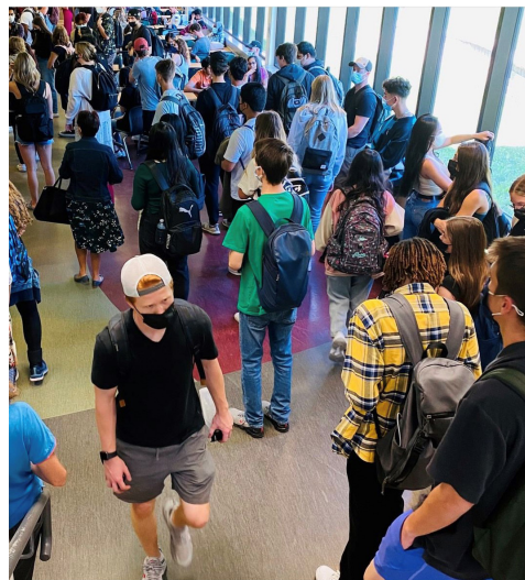
First Day Back to School at Soup 4 U

In the coming months you'll be hearing more from us about our plans to safeguard that future. As we recover from the upheavals of the pandemic, we are emphasizing the "Three R's" at St John's College. But instead of Reading, Writing, and Arithmetic, we are seeking to Renew, Restore, and Revitalize our community and our buildings. I am grateful to have you all with us as we venture into this new era in the College's storied history.