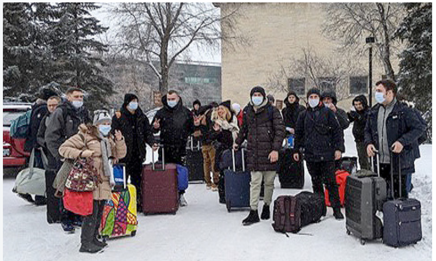
Ukrainian refugees in front of the SJC Residence

Last December, the College accepted into residence some seventeen Ukrainian refugees as our way of providing them with succor in these difficult times in their home country. They were the latest group of Ukrainian newcomers we have had living at the College since last summer. Their stay will be temporary until more substantive arrangements are concluded to settle them into Canadian life. We wish our Ukrainian friends the very best of success in their new life in Canada. We hope peace will return soon to Ukraine.