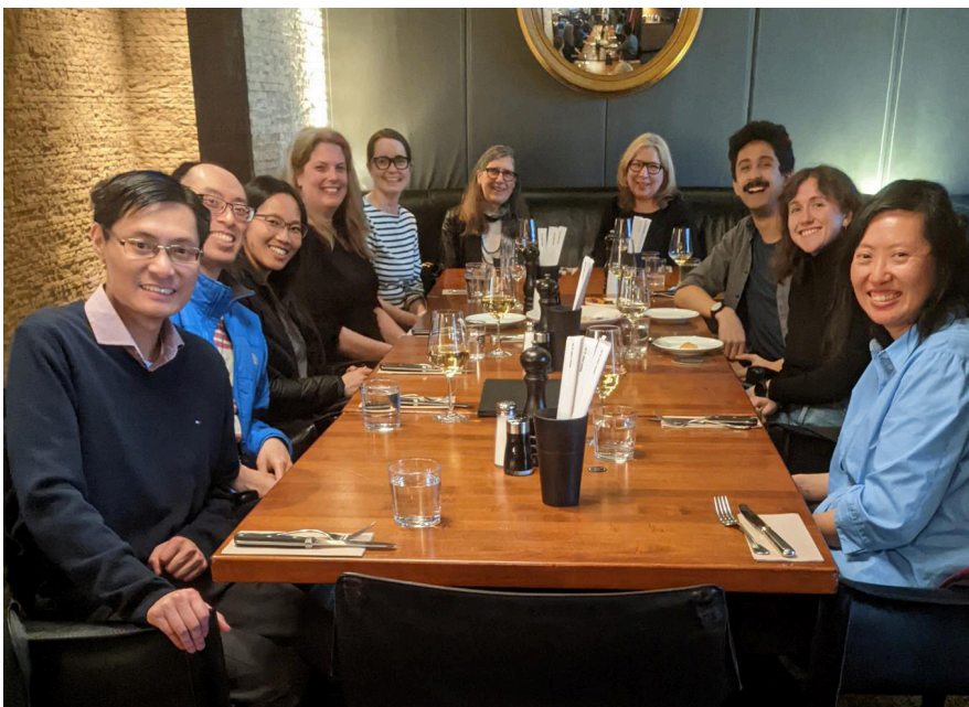
SJC Alumni Dinner in Vancouver

The two officials held two similar events, a dinner, and a luncheon in Vancouver in April.