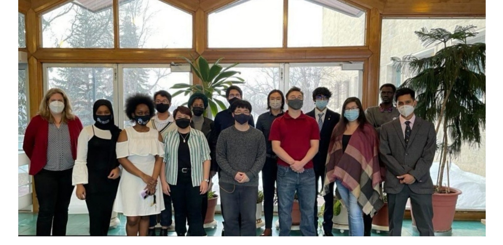
Dear St John's College friends and supporters,

Since becoming Warden last summer, it has been an honour and a joy to meet so many of you virtually and in person (as the pandemic has allowed), to hear your stories from your time at the College, and to learn about all of the ways you support our community. Your financial contributions have been especially important the last two years, as the College has navigated shutdowns and remote operations, and seen a dramatic reduction in our normal revenue streams. This report is to share with you how your generous support has been put to work, enabling us to continue serving our students, fellows, staff, and alumni through a very difficult time.