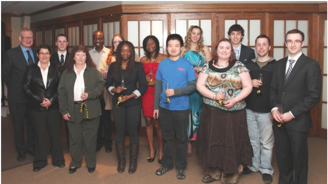
Grad Dinner 2013

THANK YOU! From all the students at St John's College!