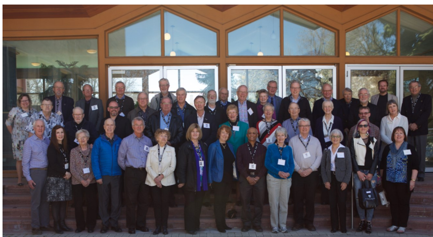
SJC Alumni and Friends gathered together on April 28-30th for the 150th Anniversary Reunion Weekend.