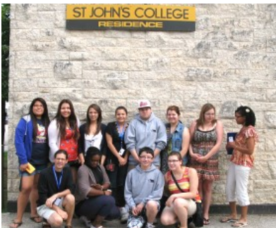
Continued support for the Health Career Quest Summer Camp