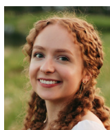
Carolyn Dyck School of Art