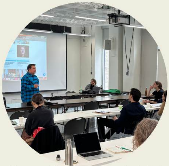
"Variations of Writing Practice: Ways to Get the Work Done," hybrid public panel hosted by the Writing Towards a Just World research cluster