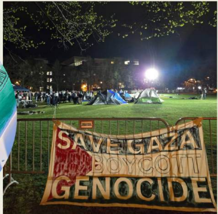
Images from the student encampment at the University of Manitoba Fort Garry Campus