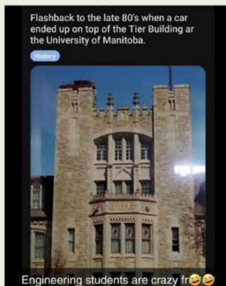
Tier Building resurfaced image (meme) from the late 80s

The constitution of the Institute for the Humanities requires the Director to report annually to the Dean of Arts, the Vice-President (Academic) and Provost, and the Vice-President (Research). It is customary for this report to be presented annually at the year-end meeting of the Board of Management. Copies are also distributed on campus to the President, the Dean of the Faculty of Arts, the Associate Deans of Arts, and many supporters who are members of the University of Manitoba community. Copies are distributed off-campus to a selection of other Humanities Institutes, and to other friends and supporters. This is the 32nd report since 1990-91, there having been no report in 1997-98.