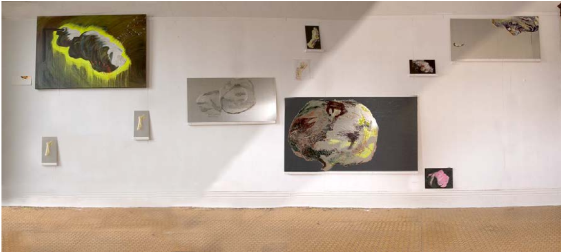
PART OF COLONIZING OORT, 21 PAINTINGS AND DRAWINGS

This is a work in progress that will eventually have enough pieces to completely fill a given gallery space with asteroid paintings and drawings.