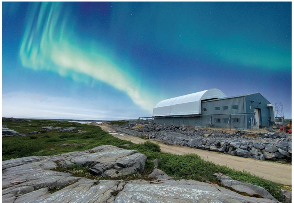
Exterior of Churchill Marine Observatory

Indigenous leaders, communities, and UM researchers are reimagining access through and proper management of Hudson Bay to transform community and regional connectivity, economic futures and strengthen regional and global supply chains. This approach will help support Indigenous sovereignty, enhance the voices of Indigenous communities, increase affordability for those living in Northern and remote areas; provide opportunities for better education, training, and capacity-building for community youth; and improve health and well-being for the First Nations and Inuit people in the region.