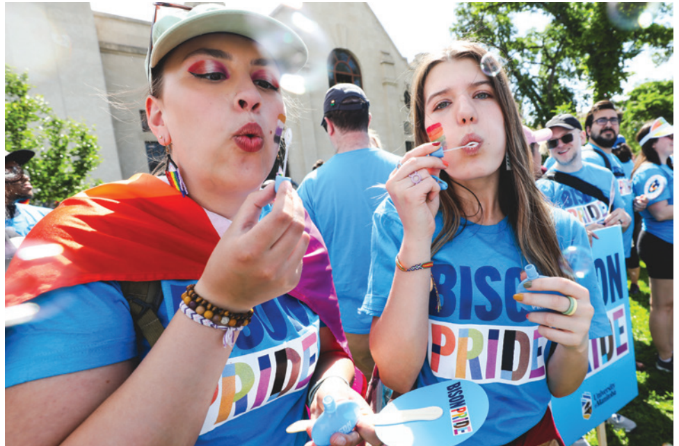
2024 Pride Parade

refugees and migration futures; and health equity, including advancing physical and mental wellness. UM researchers are finding pathways toward reconciliation; economic and environmental justice for vulnerable populations; peace and conflict resolution; the rights of Two-Spirit, Lesbian, Gay, Bisexual, Transgender and Queer Plus (2SLGBTQ+) communities; and equality and empowerment of women and girls. UM researchers are showing how both human rights and social justice frameworks provide critical tools for addressing the structural inequalities faced by Indigenous Peoples and governments in Canada and throughout the Indigenous world and can bolster Indigenous sovereignty and self-determination. Scholars in the creative arts also play a crucial role in fostering critical conversations and promoting social justice through the power of writing, music and the visual arts, facilitating a deeper understanding of diverse perspectives and advocating for human rights.