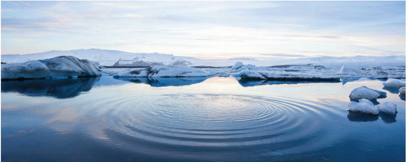
arctic water and sea ice