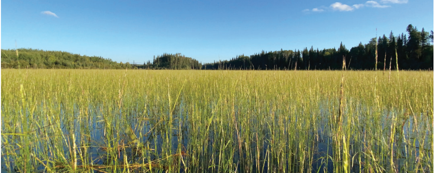
wild rice wetland in Manitoba