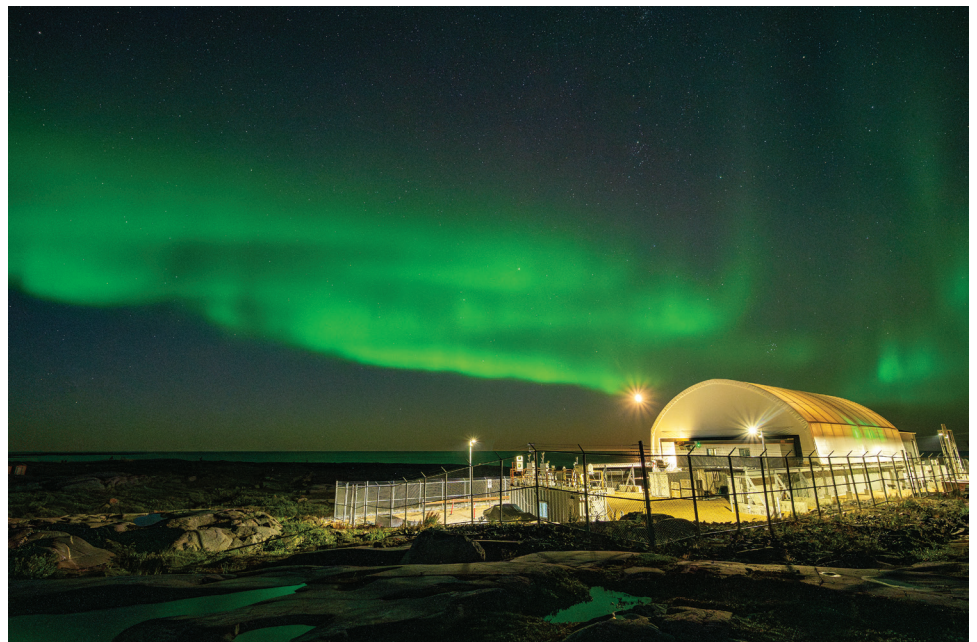
Churchill Marine Observatory (CMO)

Indigenous leaders, communities, and UM researchers are reimagining access through and proper management of Hudson Bay to transform community and regional connectivity, economic futures and strengthen regional and global supply chains. This approach will help support Indigenous sovereignty, enhance the voices of Indigenous communities, increase affordability for those living in Northern and remote areas; provide opportunities for better education, training, and capacity-building for community youth; and improve health and well-being for the First Nations and Inuit people in the region.