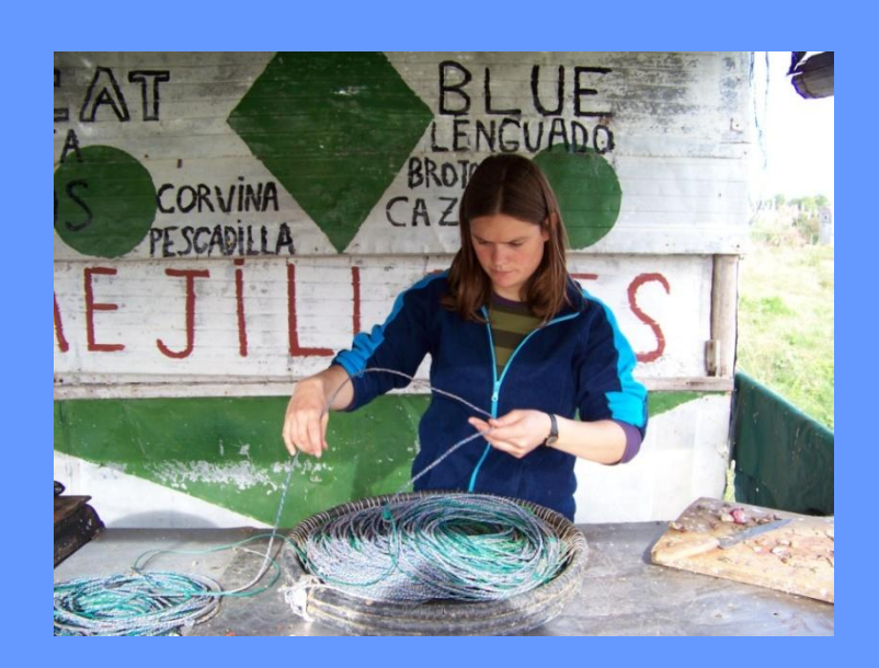
Thanks! Obrigada! Gracias!