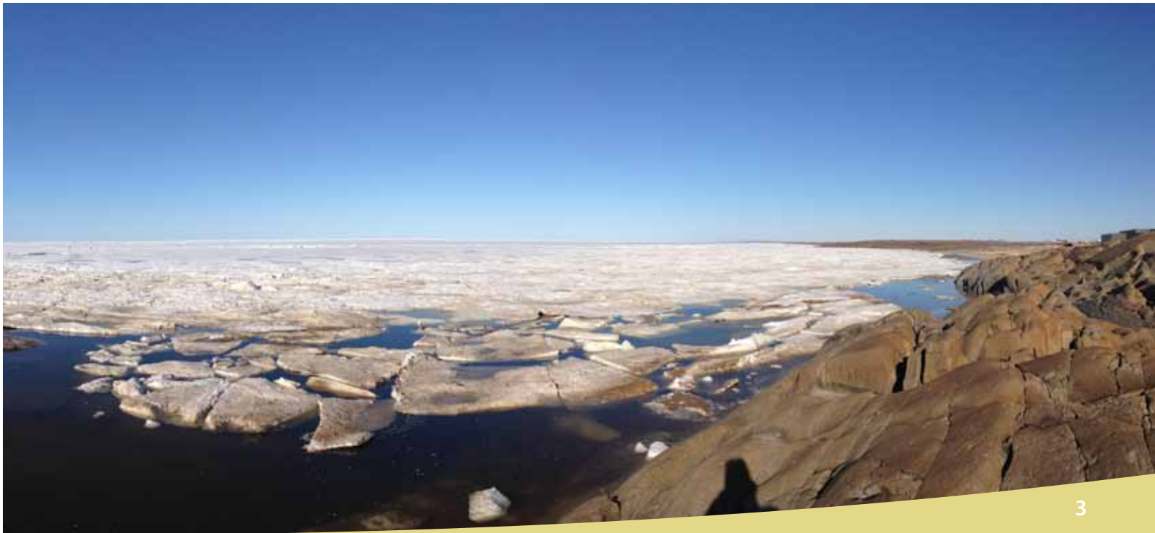
A view of Hudson Bay.

those of hydroelectric regulation of freshwater on changing physical, biological and biogeochemical conditions in Hudson Bay. 'Bay-wide' work will be conducted aboard the research icebreaker CCGS Amundsen, where scientists will focus on contrasting the Churchill (low) and Nelson (high) outflows into estuaries. This research will provide the basis for decision making around existing infrastructure operations and core fieldwork components. In addition, it will enhance the quality and capacity of environmental science in the regions in which it operates, produce reliable assessment of impacts of climate change on water supply, and increase our understanding of the effects of climate change on northern ecosystems. More broadly, Nunavut and Canada will benefit from a better understanding of how seasonal shifts in freshwater, sediment and nutrient delivery and climate change may affect primary and fisheries productivity, and transportation in Hudson Bay and how this may change under a future climate.