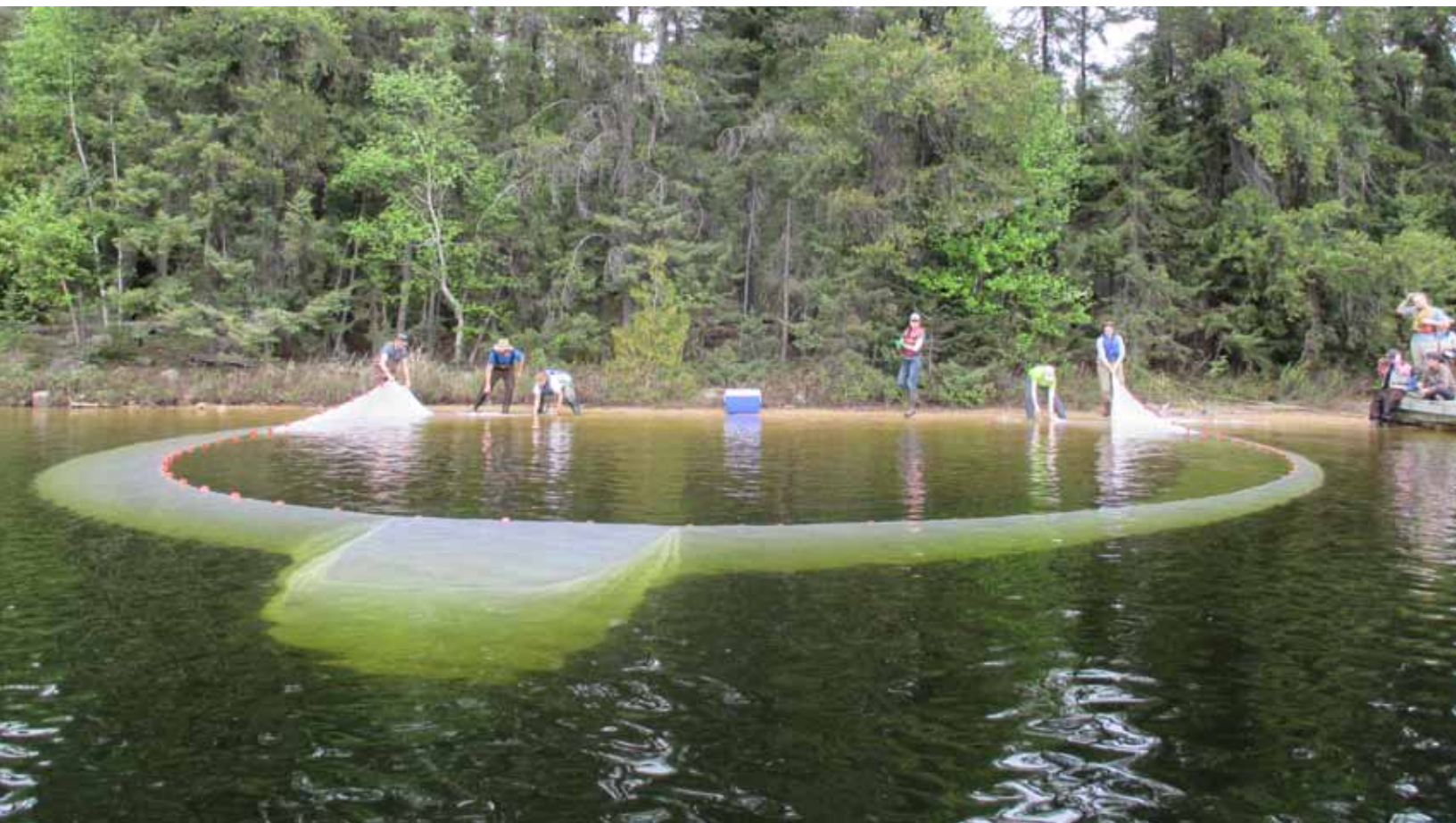
Students seine net for young-of-the year perch as part of ELA's longterm fish monitoring program.