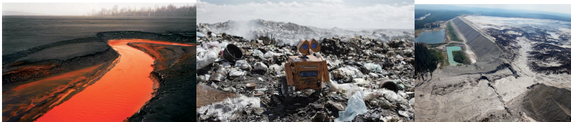
“Nickel Tailings no. 34” Edward Burtynsky; Wall-E Amidst the e-waste ; Mount Polley Mine Disaster near Quesnel, BC