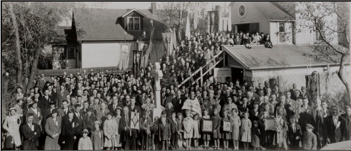
St Michael's Ukrainian Greek Orthodox congregation 1937 (UCEC)

join the Ukrainian Greek Orthodox Church, and even then, only after being promised a 'Bukovynian' priest (rather than a native of Galicia or central Ukraine).