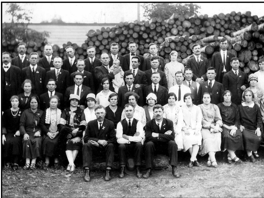
Markiian Shashkevych Heritage School Association 1926

Although a majority of the Ukrainians residing in Point Douglas were Catholics, they did not have a parish of their own until 1938 when St Andrew's Ukrainian Catholic parish was established and a church built on several lots bordered by Euclid, Jarvis, Hallet and Meade. At about the same time a Ukrainian Labour Temple was built on Euclid Avenue near the corner of Main Street.