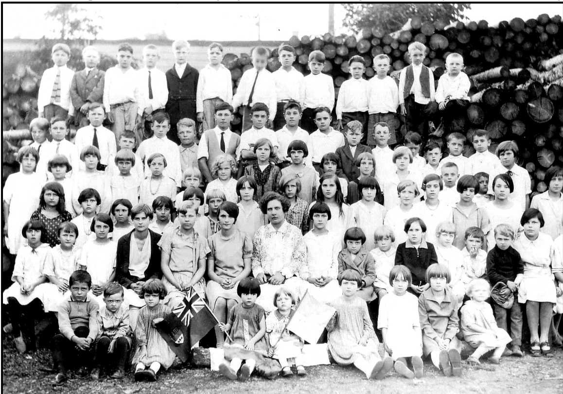
Markiian Shashkevych Ukrainian Heritage School 1926