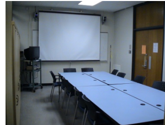
103C Isbister - Seminar Room

The Resource Room located in 103B Isbister stores all the Language Centre's Resources. It includes DVDs and Blu-Rays, VHS tapes, CDs, books, and games from the different languages taught in the Faculty of Arts. Resources can be set aside ON RESERVE for the length of the term to make sure students can view the films in the Resource Room. Students can view films on the computers or on the television in the Resource Room during regular office hours.