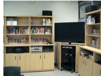
103B Isbister - Resource Room

The Language Centre sound booth is used for recording clear audio for course content, tests and/or exams.