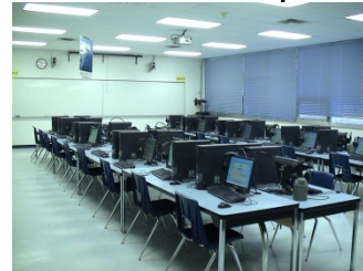
102 Isbister - 30 Computers