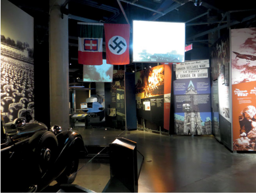
Fig. 4 Opening section of gallery “Forged in Fire: The Second World War, 1931–1945.” Permanent exhibition. Canadian War Museum, Ottawa.

through a synopsis sentence: “Canada’s fight against dictatorships overseas transformed the country and its place in the world.” In the last section, visitors encounter a large panel entitled “A Nation Transformed,” picking up on the theme of the “unfinished” nation from the second gallery. The panel text reads: “The Second World War was a massive national enterprise, and Canada emerged from the conflict as an economic and international power – united, self-confident, prosperous, and determined to make a difference in the world.” 10 The gallery develops chronologically. At the beginning, the exhibition presents the political situation in Canada and marks the emergence of dictatorships in Germany, Italy, and Japan through flags and video footage installations hanging from the ceiling (see fig. 4). The artifact of a Mercedes Benz limousine,