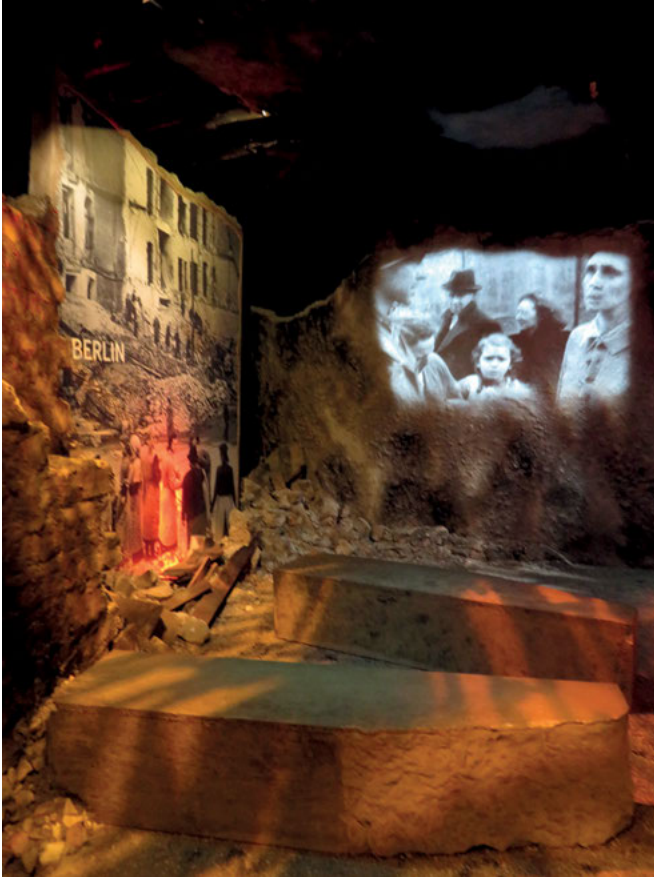
Fig. 8 Immersive film theater in ruins, room “Into the German Homeland” in “Road to Berlin” exhibition. The National WWII Museum, New Orleans.

regarding the last months of the war featuring a destroyed Germany, the Volkssturm, Hitler sacrificing his people, Americans acting as liberators and not conquerors, the discovery of the concentration camps, Dwight D. Eisenhower and George S. Patton in the Ohrdruf concentration camp, the Nazis’ ideology and atrocities, the strategic bombing of the German cities, the meeting of Americans and Russians at Torgau, the Battle of Berlin and the city’s surrender, Hitler’s suicide, and the unconditional surrender at Reims. Strong statements structure the film’s frame, exemplified at the beginning: “There can be only one outcome to this war: Germany’s unconditional surrender”; and in the closing statement: “Together, these men and women [the American soldiers] will share a bond of