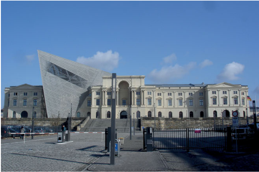
Fig. 14 Front façade of main museum building with Libeskind wedge. Militärhistorisches Museum der Bundeswehr (Bundeswehr Military History Museum), Dresden.

fragment and complicate the memory of the past (see fig. 14). 4 On June 14, 1994, the MHM was officially designated the leading museum in the Bundeswehr network, making it Germany's de facto principal army and military history museum. 5 By interweaving military history with political, social, and cultural history