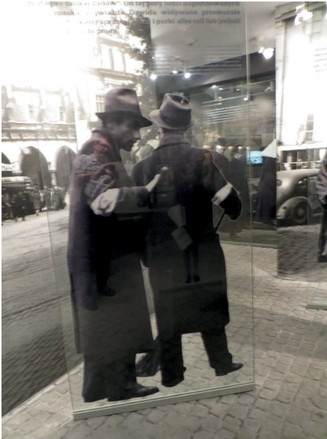
Fig. 11 Meeting historical people in transparent plexiglass panels in Kraków's Old Market Square in 1944. Permanent exhibition. Fabryka Emalia Oskara Schindlera, Kraków.

plaster, creating a gap between this representation and the people represented. In other words, although this model ghetto imitates the primary experience of the historical one and thereby impacts the visitor emotionally, visitors never lose the feeling that they are time travelers in space who are unsure of whether they have the right to see what they are viewing. The act of looking at this interior scene is more about the feelings of awkwardness created by gazing into somebody's private space than about the reconstruction of that space. This distances visitors and leads them to the meta-reflection about how immersing themselves in the past is cognitively and ethically possible, leading to effects of secondary experientiality.