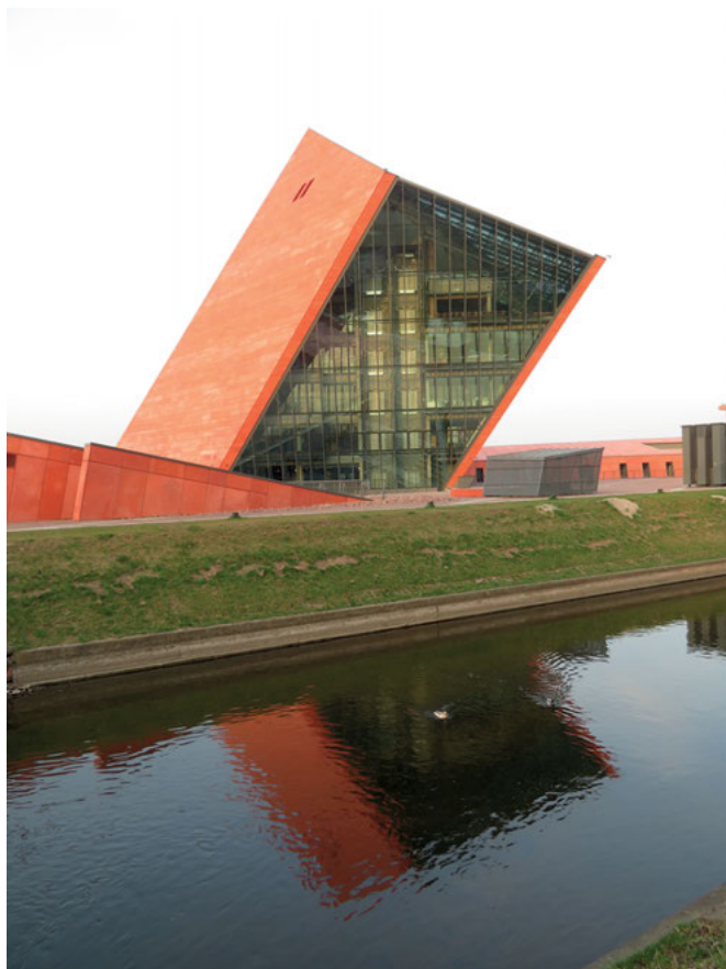
Fig. 22 Outside view of Muzeum II Wojny Światowej (Museum of the Second World War), Gdańsk.

museum. These constellations work on the European level, sometimes placing strong emphasis on Central and Eastern Europe, and to a considerably lesser extent, a global level. On the other hand, the museum is clearly nation-based: its dominating perspective is of a Poland caught between the two totalitarian aggressors of Germany and the slightly less extreme Soviet Union. 19 The majority