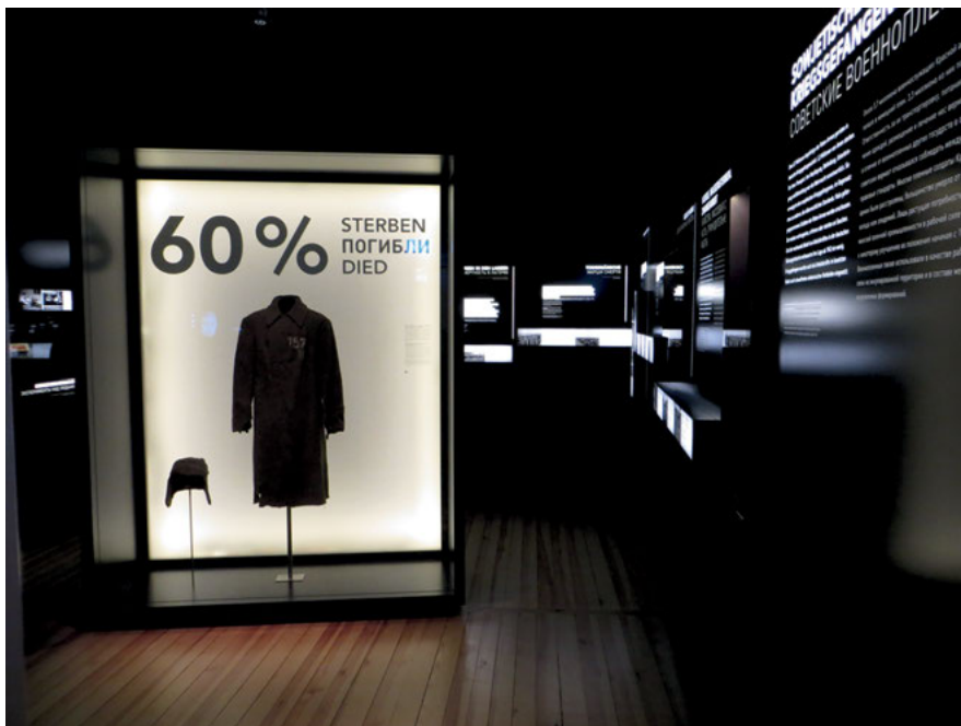
Fig. 20 Room “Soviet Prisoners of War.” Permanent Exhibition. Deutsch-Russisches Museum (German-Russian Museum) Berlin-Karlshorst.

room 4 features Soviet territory under German occupation, while room 9 features the Russian occupation of Germany and Berlin and the final days of the war. Additionally, room 5, entitled “The Soviet Union in War,” and room 8, entitled “The War in the East and German Society,” both place their focus on the two countries’ respective home fronts and civilian populations. The effect of the museum’s contrastive technique can be demonstrated through a comparison of the two rooms thematizing prisoners of war. The small darkened room on Soviet prisoners of war features an installation displaying a coat and cap of an unknown Soviet POW with “60%,” written in large font – referring to the number of Soviet POWs who died in German captivity (in contrast to 3.6% of West European POWs, see fig. 20). 8 Visitors are prepared for this topic in the section at the end of room 1, where they enter a black cube with dimmed lights, which focuses