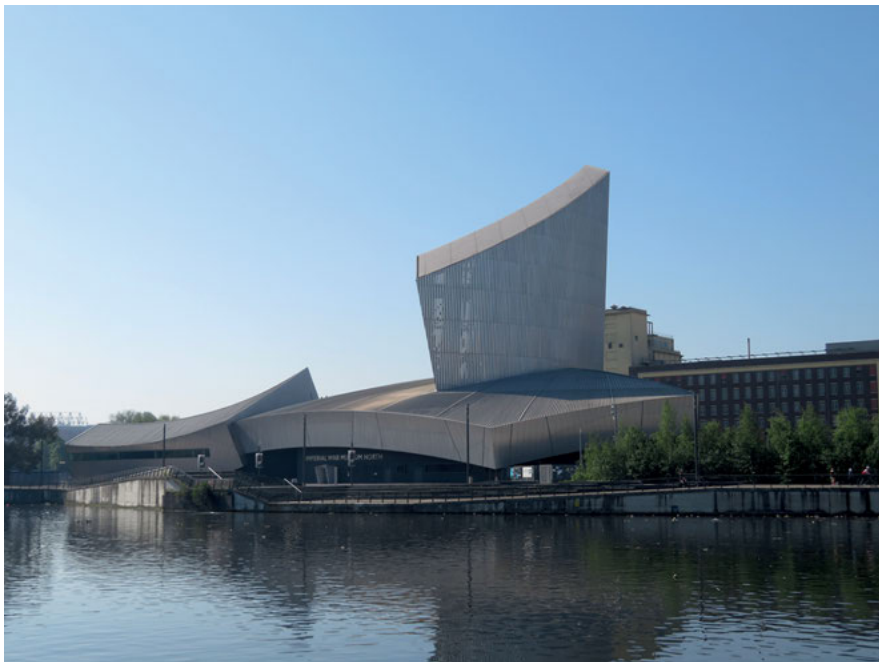
Fig. 16 Outside view of Imperial War Museum North, Manchester (Photo: Author, 2018).