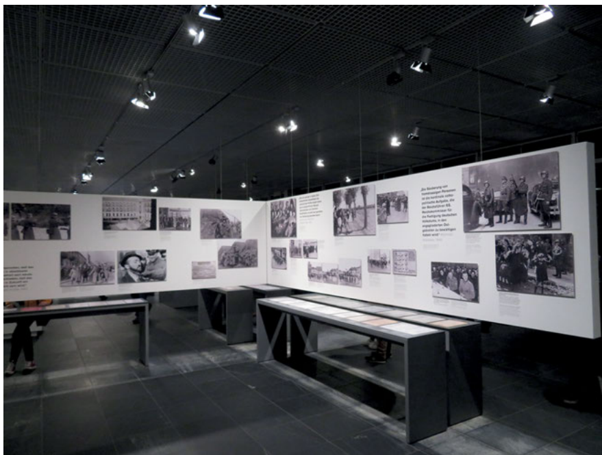
Fig. 19 Right half of section “Poland: 1939–1945.” Interior permanent exhibition. Topographie des Terrors (Topography of Terror), Berlin.

Museum. For example, the cluster about terror against the German Jews displays the process of creating and distributing antisemitic propaganda; to the passive observation of burning synagogues and public spectacles such as the burning of furnishings at the marketplace; to a carnival float with a dragon swallowing Jews (as “Judenfresser”); to public deportations. The effect of the increasing violence and exclusion of Jews from German society is again supplemented by numerous document facsimiles, several quotations, an introductory text, and a timeline. The section on German Jews connects to all the other sections of the ToT. This allows the visitor to have an abstract experience of how a group becomes socially ostracized and then annihilated, and how this was – at least passively – accepted by many Germans in the case of the Jews.