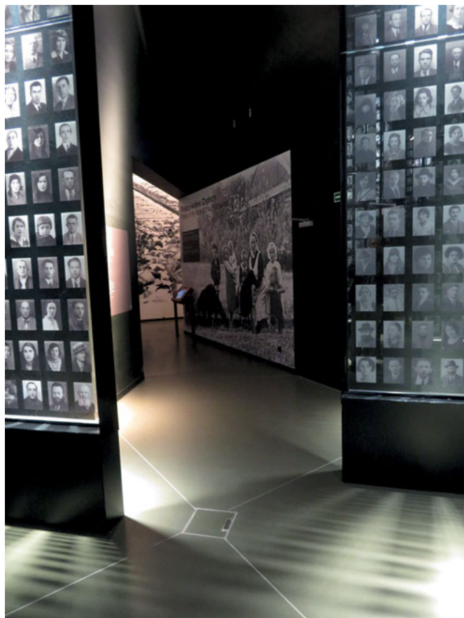
Fig. 27 Section “Poles in the Face of the Holocaust” between “Road to Auschwitz” section (background) and “People like us” installation (foreground). Permanent Exhibition. Muzeum II Wojny Światowej (Museum of the Second World War), Gdańsk (Photo: Author, 2018).

Poles and Polish Jews. Even though the display did not receive much attention from visitors during my two-day visit in April 2018, it is situated at a crucial point between a large iconic poster-sized photograph of the unloading ramps – with remains of the victims in the front and the Birkenau gate in the back – and the “People like us” installation that allows for the commemoration of victims (see fig. 27). Here, visitors walk through rectangular columns displaying portraits of Jewish Holocaust victims. 60 If the visitor stands between the columns