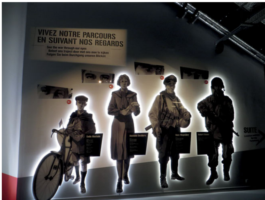
Fig. 12 Narrative characters “See the War through our Eyes.” Permanent exhibition. Bastogne War Museum, Bastogne.

as real historical figures. 42 In the exhibition’s last section depicting the end of the war, the audio tour ends with the story of all four characters – as if they had lived through the Battle of Bulge – and describes their fate afterwards. In this way, each character is given a typical fate that many endured after the war. Robert, whose brother John died in the Pacific, takes over his parent’s shop, has three children, but loses his oldest son in Vietnam. “Wars have caused me so much pain.” He returns to Bastogne and the Mardasson memorial with the veterans of the 101st Airborne Division. Hans, originally from Frankfurt Oder in the East, relocates to West Germany in order to get involved in politics alongside Chancellor Konrad Adenauer. “I participated in the reconstruction of my country and Europe so that a war within its borders would never again be possible.”