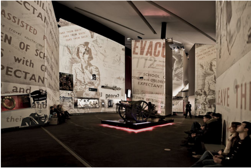
Fig. 17 Scene from the Big Picture Show “Children and War.” Permanent exhibition. Imperial War Museum North, Manchester (Photo and © Imperial War Museum).

impossible to see any other parts of the exhibition. 59 The IWMN is certainly the museum building by Daniel Libeskind in which architecture and interior exhibition are the most interwoven, 60 in contrast to the MHM or the Jewish Museum in Berlin, where curators and design companies can use the architectural space more freely to develop their exhibitions.