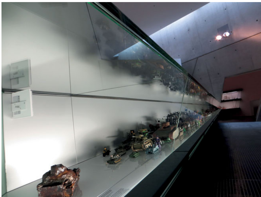
Fig. 2 Destroyed Gama toy tank opposite to parade of war toys. Permanent exhibition. Militärhistorisches Museum der Bundeswehr (Bundeswehr Military History Museum), Dresden (Photo: Author, 2013, courtesy of Militärhistorisches Museum der Bundeswehr).

in play: “The child alone, almighty and godlike, determines the course and outcome of the war. The omnipotence experienced in play contrasts with children’s experiences of helplessness in real war.” The visitor who reflects upon the installation can experience some of the fun of playing as well as the sobriety of the real war as symbolized by the burnt-out tank. The artifact is even more powerful since its destruction replicates exactly how a real tank is destroyed in combat. That the tank is a concrete artifact from firebombed Dresden intensifies its authenticity and the perception that it stands metonymically for the real war. The installation creates an experiential stage for visitors to connect the past with their present attitudes or those from their childhoods. Would one allow one’s child to play such war games? Did one love playing such games as a child? What are the repercussions of reality overlapping with a game scenario? The tank is ambiguous, oscillating between being a ‘victim’ of the Allied fire bombings and a ‘perpetrator’ metonymically pointing to German atrocities, between being a symbol of defeated evil and a symbol of such evil’s afterlife in