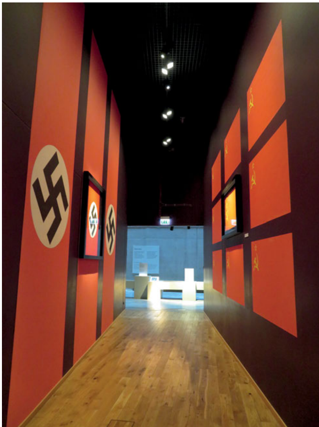
Fig. 23 Corridor between Nazi Swastikas and Soviet Hammer and Sickle Flags. Permanent Exhibition. Muzeum II Wojny Światowej (Museum of the Second World War), Gdańsk.

Wartime atrocities originate in the war's first phase, particularly during the Polish campaign and occupation. For example, in the museum's third section, "War after All," the visitor is confronted with the immediate crimes of the German Einsatzgruppen , early in the war, following actions of the Wehrmacht against Polish civilians and the Polish elite: this is done through a scenic installation of suitcases, large poster-photographs, and filmic evidence displayed on a small screen. It speaks to the museum's reflectedness that it also reflects on possible Polish atrocities when it displays a film on the so-called 'Bloody Sunday,' in which German civilians were killed in Bydgoszcz, reflecting on the construction of propaganda and history from both sides. The next room symbolizes the begin-