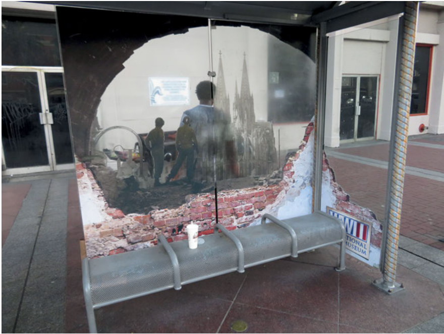
Fig. 9 Immersive bus stop in the ruins of Cologne. Advertising for The National WWII Museum, Canal Street, New Orleans (Photo: Author, 2017).

the multimedia installation, while these battle contributions remain more of a gimmick. 15 Nobody, despite the explosions at the end, will feel as if they have come close to participating in an actual battle and even less to being in danger (one can check at the end whether the crewmember that one was assigned survived). Thus, USS Tang experience is a mixture of entertainment, storytelling, and the commemoration of a heroic boat and crew.