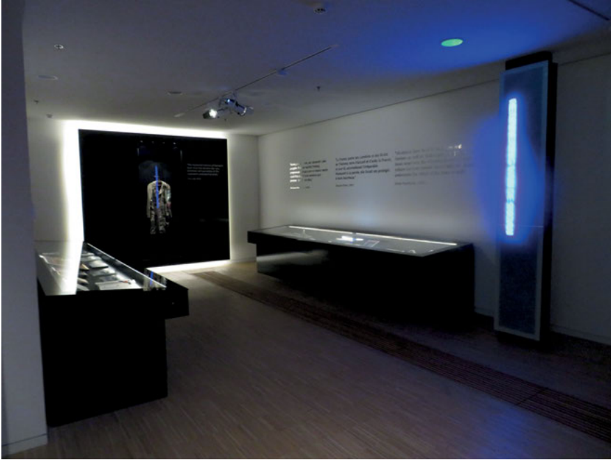
Fig. 26 Section “Memory of the Shoah.” Permanent Exhibition. House of European History, Brussels.

These principles of European heritage occur throughout the exhibition, usually without explicit reflections. However, the HEH misses the opportunity to reflect on its open-ended questions again at the end of the exhibition. Unlike the European heritage section, the actual exhibition is far less open. This becomes clear in the memory sections, where the Holocaust and the Second World War re-appear on the fourth and fifth floors of the museum, particularly in the section “Memory of the Shoah” (see fig. 26). 68 This section is comprised of six horizontal vitrines holding objects, each paired with a quotation on the challenges of post-war memories, the silence surrounding complicity, and the emphasis placed on individual national suffering in West Germany, East Germany, Austria, Poland, France, and Ukraine. All of these object arrangements are created to prove the last sentence of the section’s introduction: “Today, however, the acknowledgement of this unparalleled crime against humanity is at the core of dis-