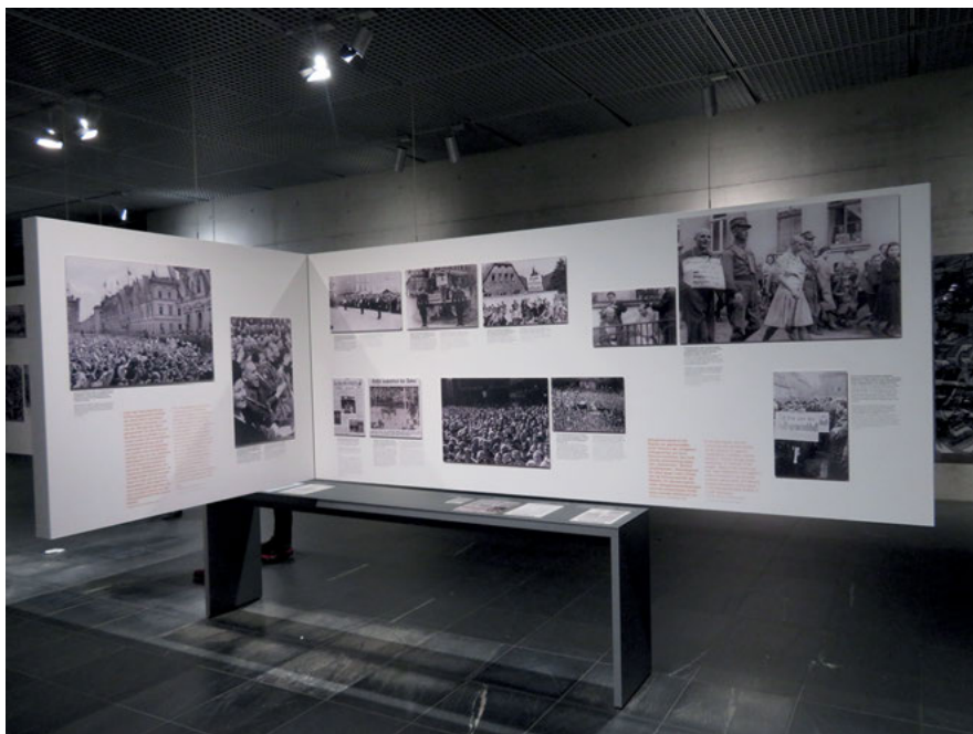
Fig. 18 Part of section “The ‘Volk Community.’” Interior permanent exhibition. Topographie des Terrors (Topography of Terror), Berlin (Photo: Author, 2017, courtesy of Topographie des Terrors).

some of the spectators. The second picture depicts eager spectators, mostly smiling and happily watching the scene. 74 Whether the audience was staged to produce photographs for propaganda purposes or not, the visitor comes away with an impression of how the Nazis created their community and that the spectators appeared to attending these events voluntarily. Visitors encounter this type of forced public humiliation throughout the exhibition. In a photo in the very first section, “Terror and ‘Coordination,’” 75 a Social Democrat and local councilor is led through the city of Hofgeismar on an ox in May 1933. A large number of spectators, especially young people, flank the procession. Right next to this, the visitor encounters an image of anti-Jewish terror in Duisburg, in which SS force three Jewish men to carry a black-red-gold flag through the city. Many spectators are present and the exhibition ensures that visitors are able to recognize that