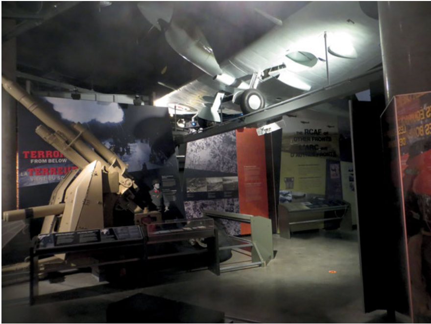
Fig. 5 “The Air War” section with subsections “Terror from Below” and “Bomber Command” in background, gallery “The Second World War: 1931–1945.” Permanent exhibition. Canadian War Museum, Ottawa.

infrastructure, it seems much more likely that this painting will enhance the museum’s narrative of the war as just and necessary. The interpretive possibilities this painting holds are diminished, as it is instead positioned to serve as evidence for the narrative argument made by the Second World War gallery.