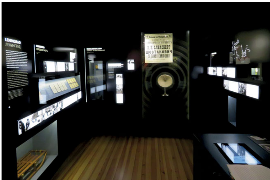
Fig. 21 Section “Leningrad.” Permanent Exhibition. Deutsch-Russisches Museum (German-Russian Museum) Berlin-Karlshorst.

detailing the siege of Leningrad (see fig. 21). At this point in the museum, visitors will have just emerged from the two perpetration rooms concerning Soviet POWs and German atrocities during the occupation of Soviet territory (see also Jaeger 2017a, 35, 2017c, 154–155). They have therefore already been experientially immersed in questions of survival. Whereas a straightforward section on the Leningrad siege might exclusively capture the suffering of the Russian people and their will to survive, the transnational approach of the DRM contextualizes this historical episode in a way that surpasses its portrayal as an isolated event. Therefore, visitors are steered away from simply lamenting the death, atrocities, and costs of war stemming from the siege: instead, the exhibition creates a secondary experientiality surrounding collective behavior. This transnational approach prevents the simple repetition of Soviet or German wartime propaganda and at the same time allows for genuine simulations of collective perspectives.