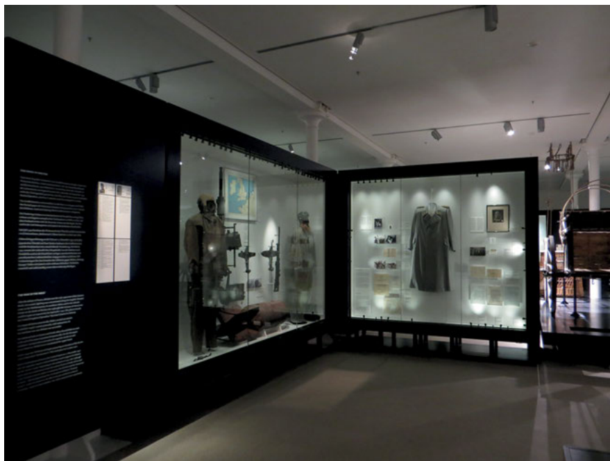
Fig. 30 Cabinets “Battle of Britain” and “Luftwaffe Personnel.” Permanent exhibition. Militärhistorisches Museum der Bundeswehr (Bundeswehr Military History Museum), Dresden.

tle of Britain and fell in September 1940. The visitor can ask endless questions about either biography. What would have happened if Homer had been alive when the Royal Air Force started its strategic bombing campaign? Was Steinhoff merely a fighter pilot doing his job? Did they want to remove Göring purely for military or also for ideological reasons? What did Steinhoff do when he was a fighter pilot in Russia? How did he support the bombing of civilians? The contrast between the two biographical tables intensifies the possible questions. Rather than answering some of these questions, the MHM employs a representational technique that, through gaps such as these, forces the visitor to reflect upon possibilities and open questions.