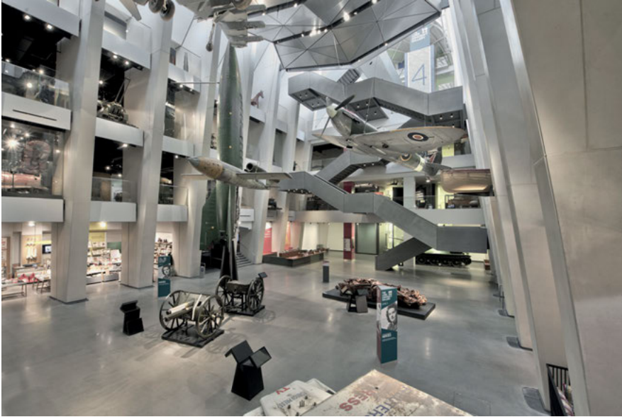
Fig. 28 Atrium and “Witnesses of War” exhibition. In center, installation of V2 rocket and V1 flying bomb. Imperial War Museum, London.

with a little red square and the caption “YOU ARE HERE.” The map of the attacks then extends to the museum’s surroundings in Lambeth, followed by photographs of the damage. In the second half of the slide show, the visitor sees images of the appalling conditions in the concentration camp Mittelbau-Dora where the V2 was partially produced. The visitor is pointed to The Holocaust Exhibition on the fourth floor, where a uniform worn by Jan Imich, a survivor of the V-weapon production, is displayed. The museum then juxtaposes Wernher von Braun’s post-war work on rocket development in America (influential, among other things, for the moon landing) with his knowledge of the conditions of Mittelbau-Dora. It notes: “A generation after his V2s had terrorised cities across Europe, von Braun became a national hero in the United States.” 30 The slide show closes with the words “His legacy, and those of the rockets he designed, is deeply ambiguous.”