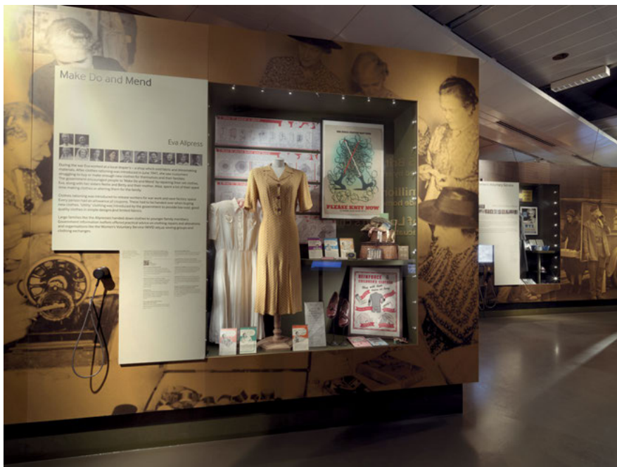
Fig. 7 “Make Do and Mend” cabinet. Family in Wartime exhibition. Imperial War Museum, London (Photo and © Imperial War Museum).

The display case contained a few dresses and pairs of shoes, but it mainly presented posters such as “Please Knit Now” as well as title pages and illustrations from do-it-yourself manuals. The whole section served an illustrative function for the duty and everyday life of British citizens on the home front; the Allpresses made-do and did a lot of mending. In the middle of the exhibition, there was a quotation by Nellie: “we were all so anxious to stay alive that we just sort of carried on,” indicating the sober mood of everybody living through the war. Similarly, two quotations from after the war read: “The war had finished, you just couldn’t believe it” (Betty) and “We were lucky enough that we had all our brothers coming back” (Eva). These quotations demonstrated the personal relief and joy felt by most at the end of the war, in stark contrast to the photographs of the destroyed Anderson shelter.