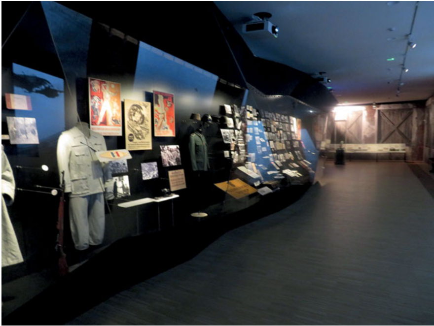
Fig. 25 “World War II” gallery. Permanent Exhibition. House of European History, Brussels.

German Russian Museum and the Imperial War Museum North all use specific historical examples, tell stories, and allow individual voices to be heard, the HEH completely lacks such story-telling. For example, the starvation section works in a very similar way to the every-day life section in Gdańsk. Objects and photographs serve as almost arbitrary token representations of every country: The difference that this exhibition holds to the MIIWŚ, is that this arbitrariness of objects is present across all sections, whether it be the Air War, 63 forced labor, or relocation and deportation sections.