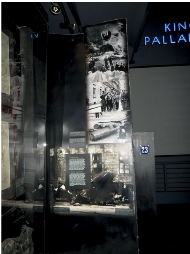
Fig. 6 Part of section “Airdrops.” Permanent exhibition. Muzeum Powstania Warszawskiego (Warsaw Rising Museum), Warsaw (Photo: Author, 2013, courtesy of Muzeum Powstania Warszawskiego).

el’s text quotes the British pilot Stanley Johnson: “If only we could have landed there [on Soviet airfields], we could have taken an additional load ... I could never understand the Russians standing on the other side of Vistula River.” The quotations blame the Soviets for denying the Allies use of their airfields and are then expanded toward the claim that the Soviets could have prevented the destruction of Warsaw – a crucial claim for the museum’s narrative. 28 That