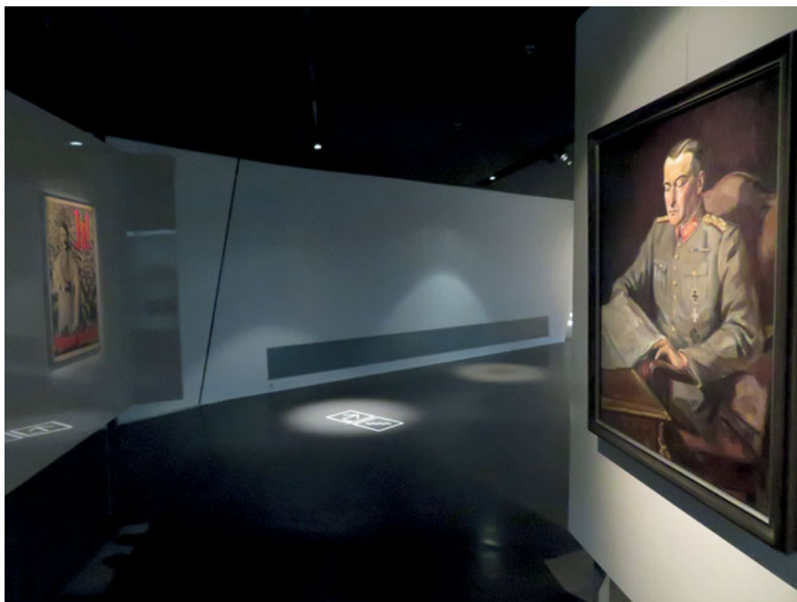
Fig. 15 General Kurt G. A. P. Hammerstein-Equord and Adolf Hitler ‘looking at each other.’ Permanent exhibition. Militärlhistorisches Museum der Bundeswehr (Bundeswehr Military History Museum), Dresden (Photo: Author, 2013, courtesy of Militärlhistorisches Museum der Bundeswehr).

causal structure between German bombings of civilians and the Allied Air War against Germany. However, the visitor could still ask why a German war artist such as Eichhorst drew this scene. Does it really show the brutality of war or is this simply the museum’s interpretation, originating in the twenty-first century? Paintings immediately create space for interpretation if they are presented as openly as in the MHM. Nagel’s painting depicts an old central town square; flashes come from the sky; one church and an adjacent house are on fire; and shadowy people are running over the square. Did Nagel want to express the suffering of German people and the destruction of civil space? Is this a political painting or a realistic one that simply captures an atmosphere? The viewer is given the option to interpret the flashes from the sky as Godly punishment or as sublime spectacle. The painting seems to meld human destruction with nature. Due to the metaphorical scene that this section creates, each station provides considerably more experiential potential than the information panel and the individual captions accompanying the respective images and objects.