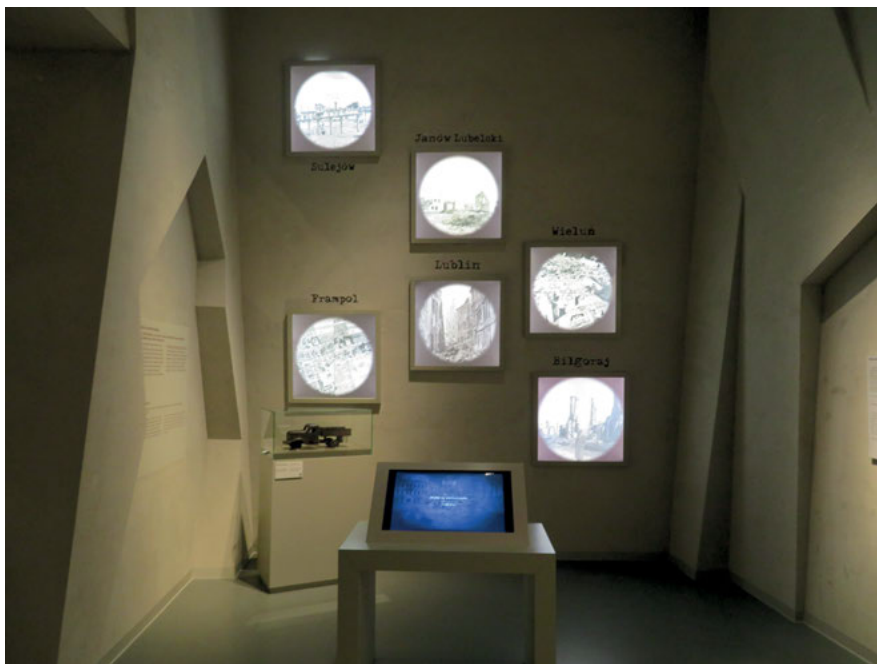
Fig. 1 Section “War of Annihilation” with “Toy car dug out from under the rubble.” Permanent exhibition. Muzeum II Wojny Światowej (Museum of the Second World War), Gdańsk.

a toy as the only artifact in this room intensifies the message of the innocent being illegally targeted. 3