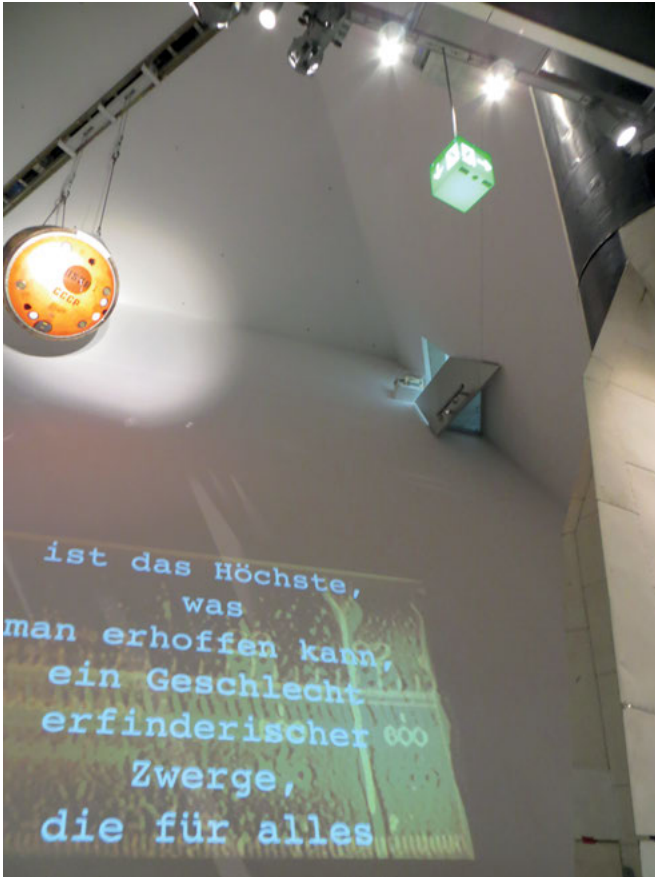
Fig. 29 Cluster of V2 rocket, dollhouse, Sojus 29, and art installation Galilei's Monologue . Permanent Exhibition. Militärhistorisches Museum der Bundeswehr (Bundeswehr Military History Museum), Dresden (Photo: Author, 2014, courtesy of Militärhistorisches Museum der Bundeswehr).

the everyday reality of living under the threat of the V2 – which would certainly not be withstood by an Anderson shelter.