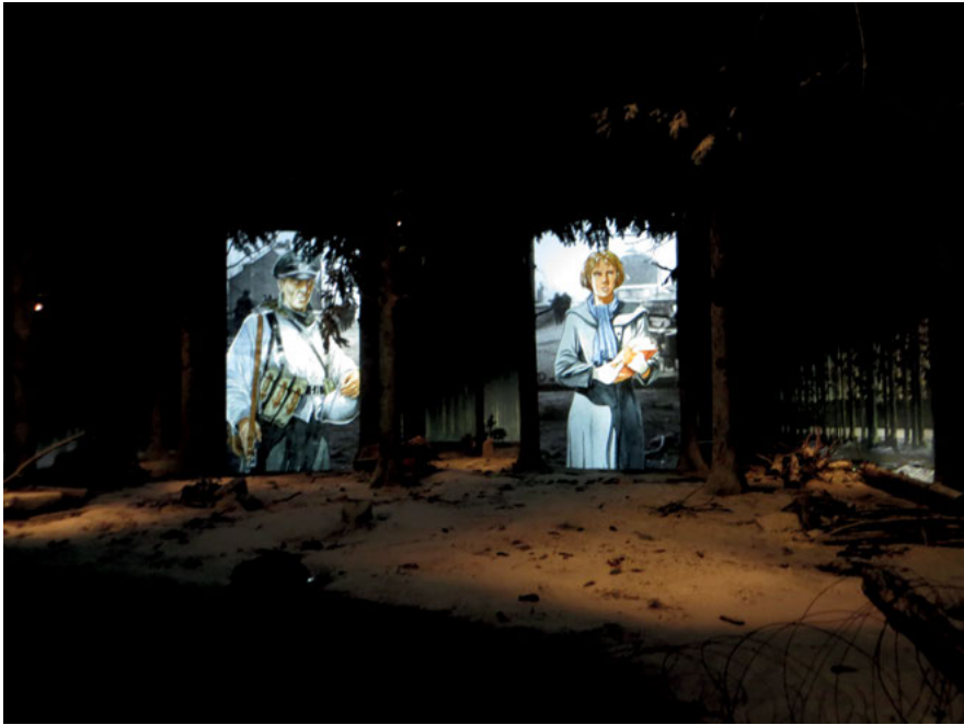
Fig. 13 Scenovision 2: “The Offensive: In the Woods near Bastogne: At the Dawn of 16 December 1944 ....” Permanent exhibition. Bastogne War Museum, Bastogne.

and how exhausted his men are after going for two days without real food. This back and forth between the two situations continues, highlighting the human needs of each group while providing an overview of the military situation. This goes on until Robert’s group captures Hans. Iconic images, scenery, a multimedia show, and the narrative all work to authenticate each other. The visitor is emotionalized to empathize with all four characters; they are all represented in a reconciliatory way, so that no conflict between them arises. The visitor can identify just as much with Robert as with Hans because of the narrative’s emphasis on their human character traits. However, this identification is continuously broken-up (see also Jaeger 2019, 60); first through the constant shift in proximity and distance to the soldiers’ ‘real’ experiences and summaries of the battle and secondly through the multiperspectival shifts between the four characters. The visitor experiences a secondary meta-reality of the whole battle that consistently includes primary forms of identification with the perspectives of specific characters.