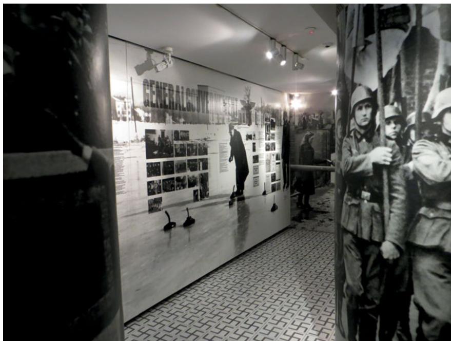
Fig. 10 Section “Generalgouvernement.” Permanent exhibition. Fabryka Emalia Oskara Schindlera, Kraków (Photo: Author, 2013, courtesy of Fabryka Emalia Oskara Schindlera).

role of Volksdeutsche and contrasts it to that of the superior Germans, neither the perspectives of the Germans nor the Volksdeutsche are expressed in the exhibition. Instead, they are presented through photographs and other descriptive materials, while the German individual remains anonymous. At the beginning of the room, the museum stages it to seem like visitors are present at Frank's triumphal inauguration. As they are forced to walk on swastika tiles and must circumvent the pillars of soldiers, the exhibition creates feelings of alienation in the visitor at this foreign intrusion. Whereas museums normally keep a distance from the enemy, here visitors enter in close proximity with the Nazis staging their political power. The theatricality of the approach is cognitively clear to the visitor, and because of this there is no danger of being seduced by the Nazi propaganda. Although the visitor is immersed in the emotional effects of foreign intrusion, the exhibition also offers plenty of room for interpretation. For example, on the wall are two signs in German “Für SS und Polizei verboten” (prohibited for SS and police) and “Für die Wehrmacht verboten” (prohibited for Wehrmacht members), used by some restaurants in Kraków to deny admittance to members of the SS, Gestapo, and Wehrmacht. While these clearly indicate that there was