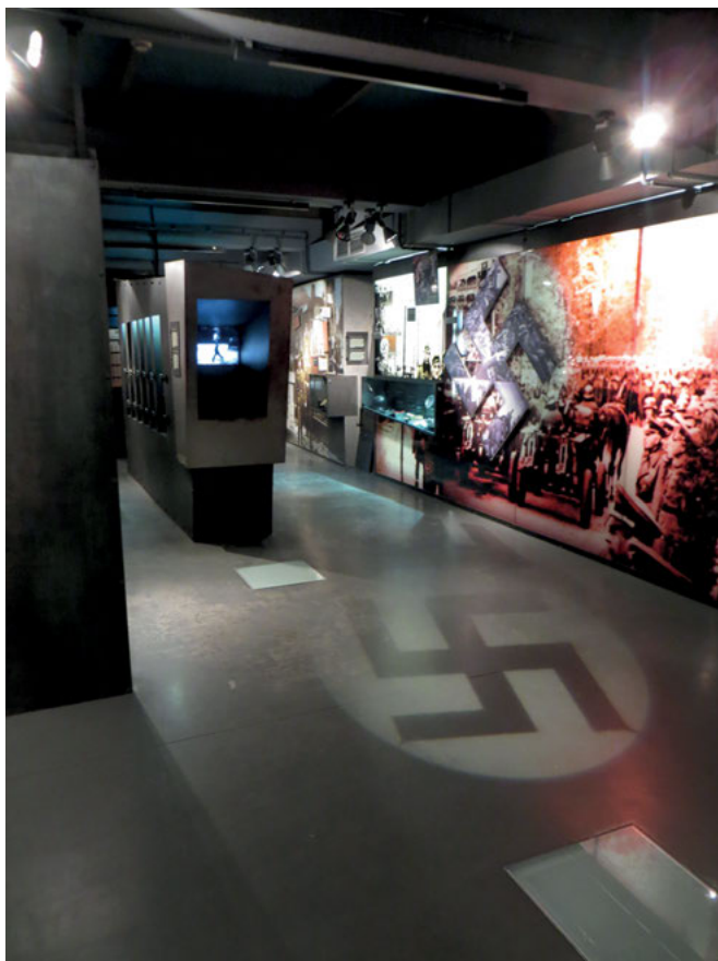
Fig. 3 Entrance area in exhibition “Germans in Warsaw.” Muzeum Powstania Warszawskiego (Warsaw Rising Museum), Warsaw.

national techniques of representation provide opportunities for the expression of structures and constellations that transcend the national. The question in analyzing historical exhibitions is thus whether the historical specificity of a nation or other group is maintained, or whether it disappears into a universal more abstract concept that surpasses the idea of the nation-state altogether. In other words, the contrast between the first and second type of transnational represen-