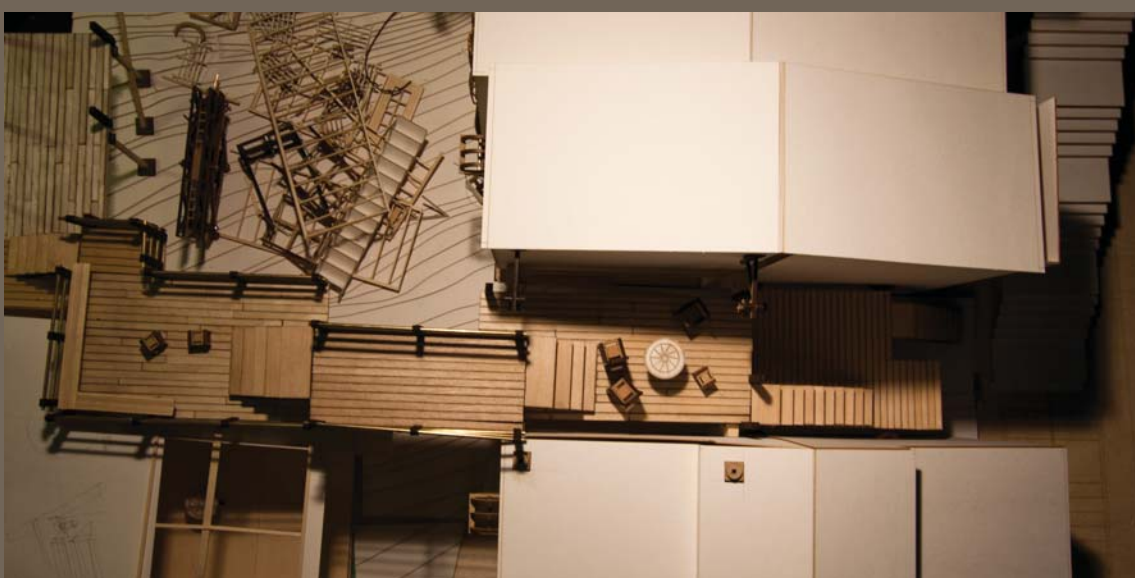
Constant reconstruction of a rhizomic threshold

“Stations and paths together form a system. Points and lines, beings and relations. What is interesting might be the construction of the system, the number and disposition of stations and paths.” *