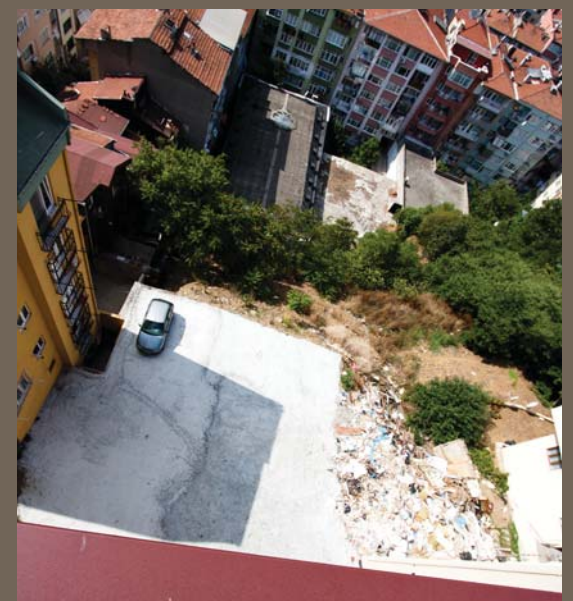
Rooftop view of courtyard