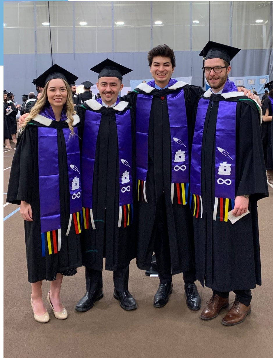
In 2018, the Indigenous Business Education Partners (IBEP) program celebrated its 125th graduate.

All themes and efforts related to this objective will be coordinated through a newly created Asper Business and Reconciliation Hub .