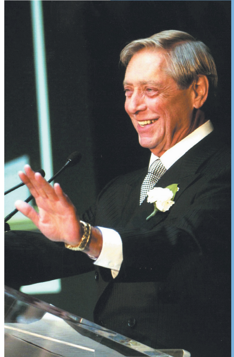
The I.H. Asper School of Business namesake, Dr. Israel Asper 1932-2003.

We will be known internationally for excellence in research and teaching, experiential learning, leadership in Indigenous business scholarship, outstanding engagement locally and globally, and the quality of our graduates.