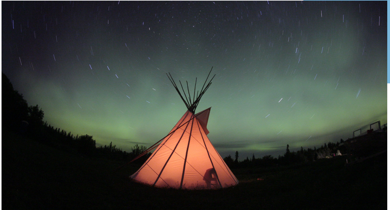
Site of former Guy Hill Residential School.