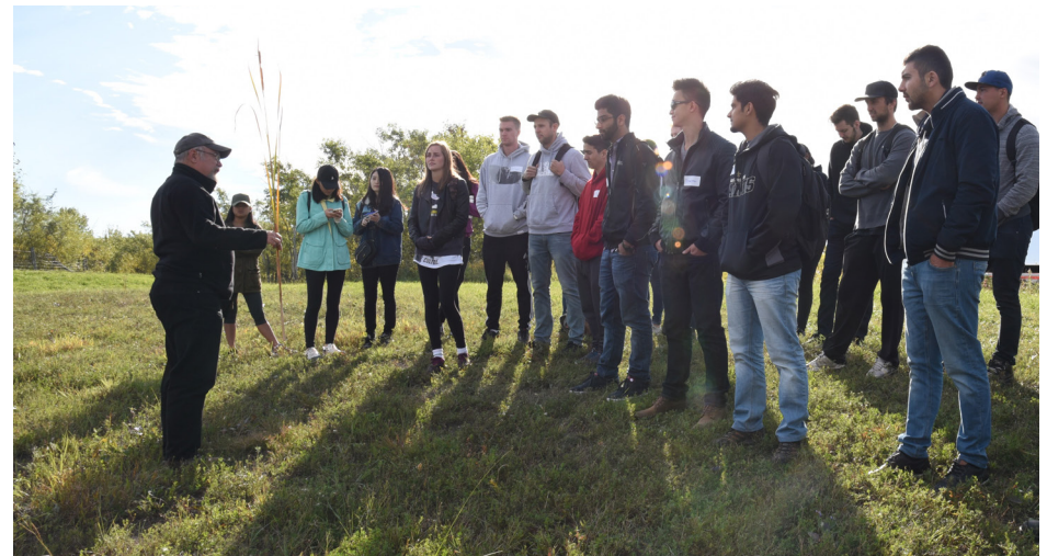
Undergraduate Sustainability Marketing students at Fort Whyte Alive for the Asper Sustainable Leadership session.