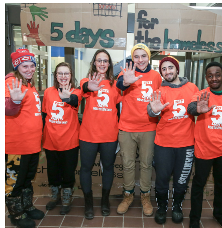
Student volunteers kick off annual 5 Days for the Homeless campaign.