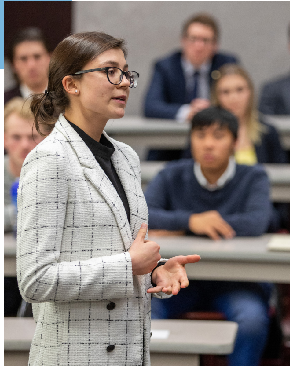
Asper undergraduate student pitches her business idea at the Stu Clark Centre for Entrepreneurship ENTR 2030 Pitch Competition.