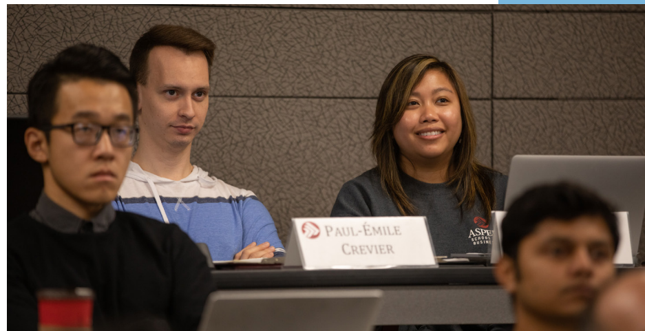
The class sizes in the Asper MBA program create opportunities for frequent class collaboration.