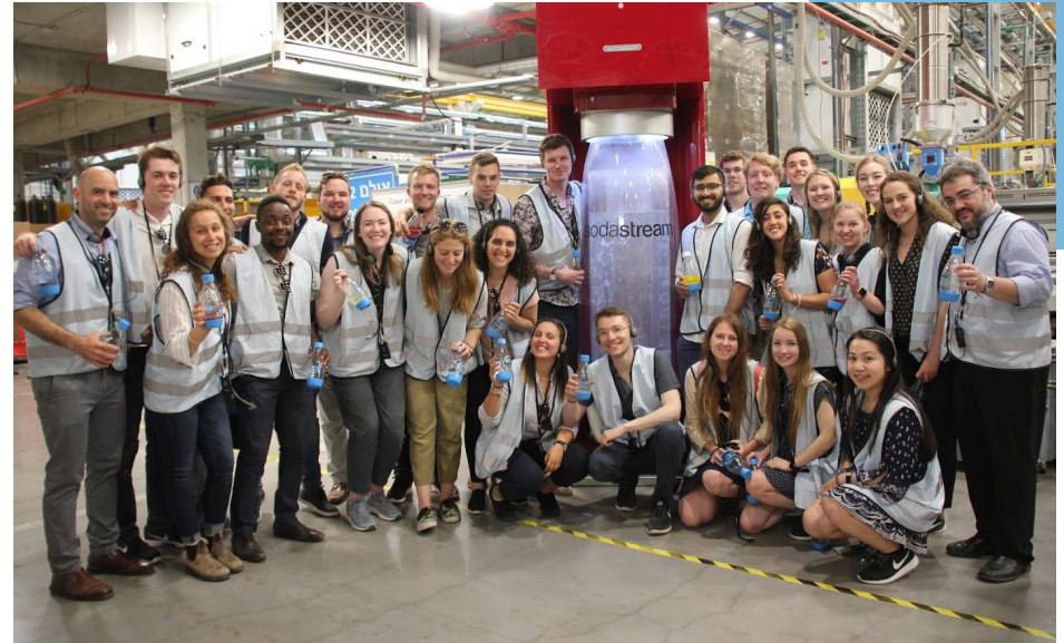
Arni Thorsteinson Study Exchange Program students at the SodaStream headquarters, based in the Negev Desert, Israel.