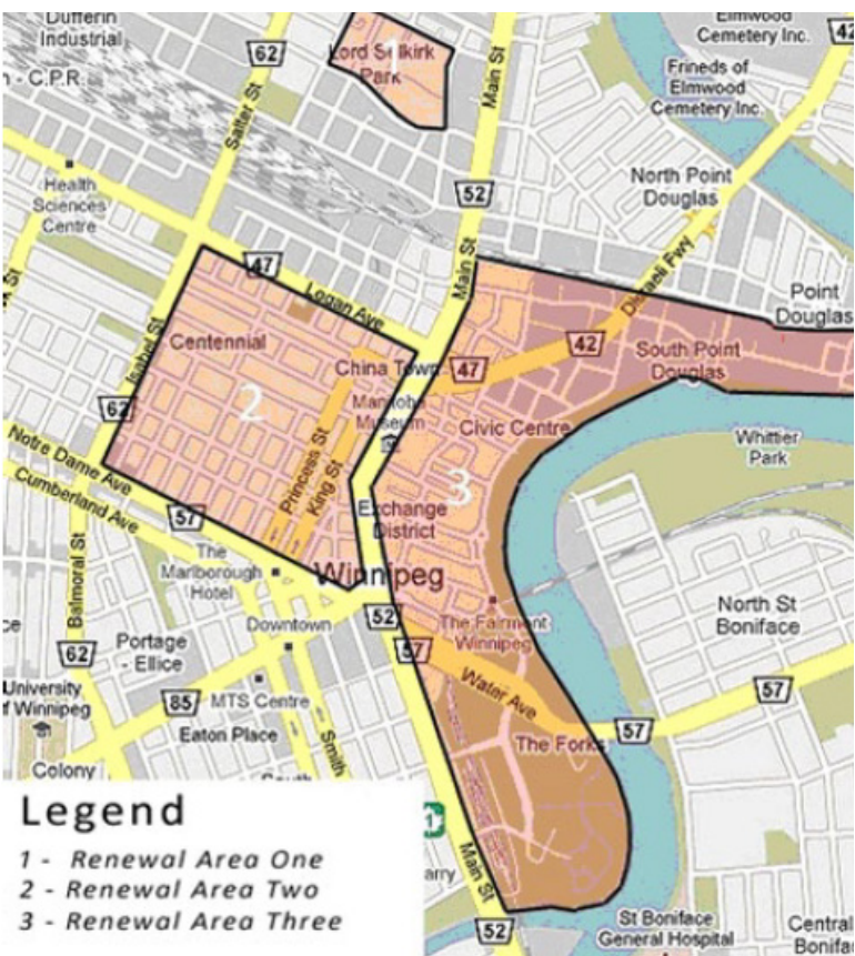
Figure 2. Winnipeg's proposed renewal areas

The story of Winnipeg's architectural heritage cannot pit opulent Beaux Art buildings of the gilded age against the rational structures of the modernist era. Some of Winnipeg's important landmarks today came from the Modernist movement.