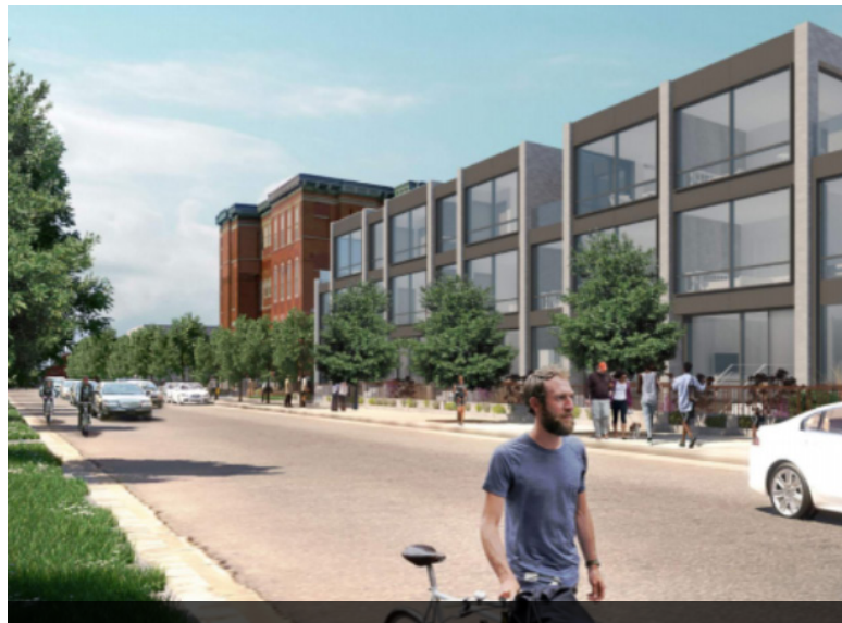
Figure 1. A render of the Teacher’s Village

Several successful examples of community participation at the grassroots level such as community-led lobbying efforts have been documented and studied. For example, in 2013, Chicago Public Schools (CPS) released their plan to shut down 54 failing and underutilized schools to help address the city’s budget deficit. One of these schools is the Alexander Von Humboldt School, a historic building in a gentrifying neighbourhood. In response, the Community As A Campus (CAAC), a grassroots organization, stepped in and proposed to redevelop the school into a teacher’s village. A mixed-use development provides affordable housing for school teachers, offices spaces for educational organizations, and spaces for community-related uses (Garcia, 2018).