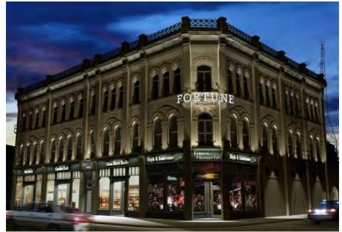
Figure 9: An artist's rendering of the fully renovated Fortune and McDonald Blocks (1882, 1883) at 226-234 Main Street, which are an excellent example of a successfully redeveloped designated heritage building that the previous owner applied to demolish after years of neglect (Bernhardt, 2018).

with this knowledge, they would hopefully engage in better maintenance practices. It could also encourage those who are uninterested in such maintenance obligations to move on.