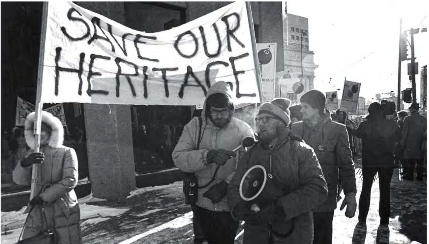
Figure 4: Citizens of Winnipeg protest the proposed demolition of the former Canadian Bank of Commerce and Bank of Hamilton on Mains Street in 1978. Their efforts helped start the heritage movement in the city.

Winnipeg's first heritage by-law, the Historical Buildings By-law 1474/77 , was passed on February 2, 1977. It established the Building Conservation List, for "the conservation and preservation of buildings of an architectural and historical interest in the City of Winnipeg" (City of Winnipeg Historical Buildings Committee, 1979, p. 3) but fell short on details, including criteria for placing buildings on the list. It was not until 1978 that an amendment to the by-law addressed these shortfalls (City of Winnipeg Historical Buildings Committee, 1979, p. 3). Amended, the by-law protected designated buildings from alteration or demolition without a Certificate of Suitability issued by the Committee on Environment. Owners of designated buildings then became eligible for grants (at council's discretion) to assist with conservation and penalties could be levied against those who disregarded the legislation (City of Winnipeg Historical Buildings Committee, 1979, p. 5).