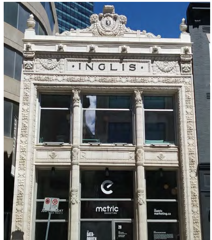
Figure 7: The Inglis Building (1908-1916) (Parks Canada, n.d.) at 291 Garry Street in Winnipeg received a grant from the Gail Parvin Hammerquist Fund in 2017 to restore its terra cotta facade (City of Winnipeg Historical Buildings Committee, 2017, p. 50). Retrieved from http://heritagewinnipeg.blogspot.com/2018/10/petite-perfection-inglis-building.html .

The Gail Parvin Hammerquist Fund – City-Wide Program By-law 9/2019 (City of Winnipeg, 2019a) sets aside 5% of the gross revenues of City of Winnipeg real estate sales to be handed out in matching grants of up to $50,000 for approved capital projects on designated heritage buildings in Winnipeg (p. 3). From 2012 to 2017, an average of three heritage buildings per year received funding from this grant (City of Winnipeg Historical Buildings Committee, 2012, p. 6; 2013, p. 25; 2014, p. 30; 2015, p. 33; 2016, pp. 49 - 50; 2017, p. 50).