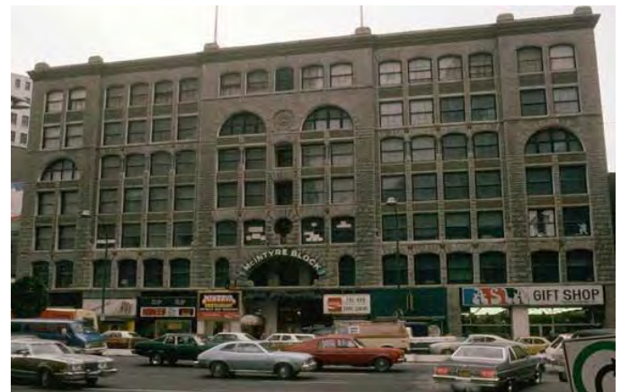
Figure 3: The McIntyre Block, seen here in the 1970s, was located at 416 Main Street, just north of Winnipeg's famous intersection of Portage and Main. Built in 1898 as commercial office space, the building was demolished in 1979 and replaced with a gravel parking lot that remains virtually unchanged as of 2019 (Goldsborough, 2019b).

The Metropolitan Corporation of Greater Winnipeg 1969 Downtown Development Plan was heralded as Winnipeg's blueprint to salvation, implementing the latest planning ideas to rebuild the aging city in the image of Toronto or Montreal (Warkentin & Vachon, 2010, pp. 58-59). Yet in less than two years, work on the plan came to a halt (Warkentin & Vachon, 2010, pp. 58, 65). Winnipeg had fallen into a deep economic recession, with interest rates climbing, investors fleeing and no public money to continue the plan (Warkentin & Vachon, 2010, p. 65). The city was left to crumble, with historic buildings being torn down and unsightly gravel parking lots being left in their wake (Cassidy, 2015).