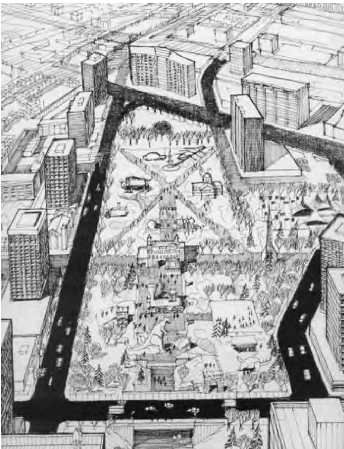
Figure 2: Central Park in Winnipeg as envisioned by the Metropolitan Corporation of Greater Winnipeg 1969 Downtown Development Plan (Section 10, Plate 26).

During the 1960s and 1970s Winnipeg was gripped by urban renewal, when wrecking balls reigned supreme, leveling the past to make way for modernization. Despite its best intentions, to transform crumbling downtowns into shiny, towering central business districts and lure back residents who had moved to the suburbs, urban renewal did not often produce the desired results. People lost their homes, communities and sense of place, and were forced off the streets into enclosed walkway systems (Warkentin & Vachon, 2010, pp. 58-59). Winnipeg did not escape this fate, having lively neighbourhoods filled with historic buildings razed to the ground and replaced with what are now considered some of the "worst planning mistakes in the city's history" (Warkentin & Vachon, 2010, p. 59).