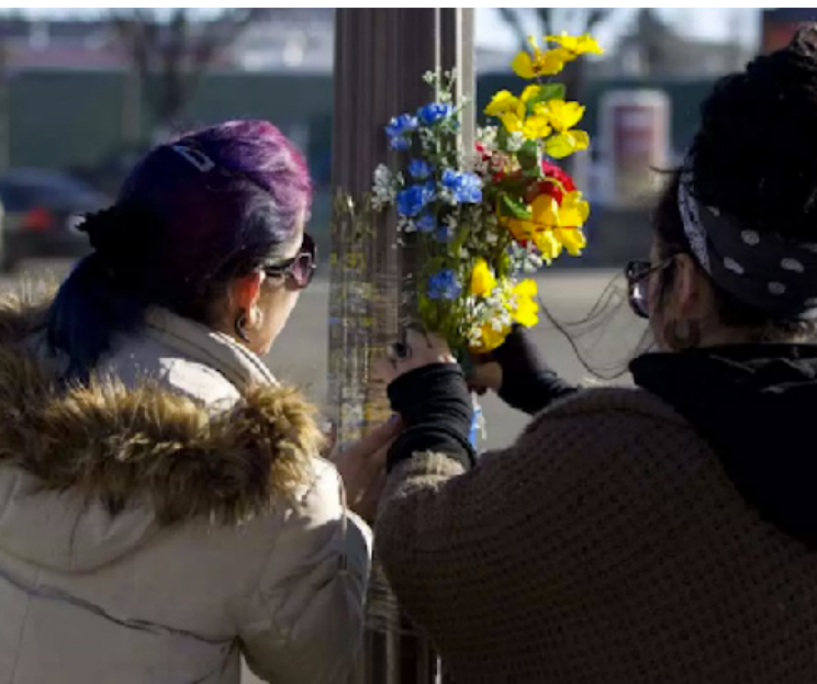
FIGURE 1 | Memorial for a Pedestrian on Whyte Avenue

This Case-In-Point has three aims: 1) to consider the framework of Edmonton’s recently adopted Vision Zero transportation policies; 2) to illustrate the critical need to improve street safety in the City of Winnipeg, citing the cost of inaction in human terms, and; 3) to offer constructive advice about how the City of Winnipeg can build consensus and momentum in order to prevent road fatalities and serious injuries in the future.