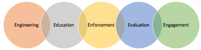
FIGURE 4 | Edmonton's 5 E's of Traffic Safety

The "fundamental key" in the Safe Systems Approach is the "design and operation of Edmonton roads that prevent collisions from occurring or reduce the severity while minimizing the possible role of human error in precipitating crashes" (Edmonton 2016, 8). This approach sets the Strategy apart from other road safety strat-