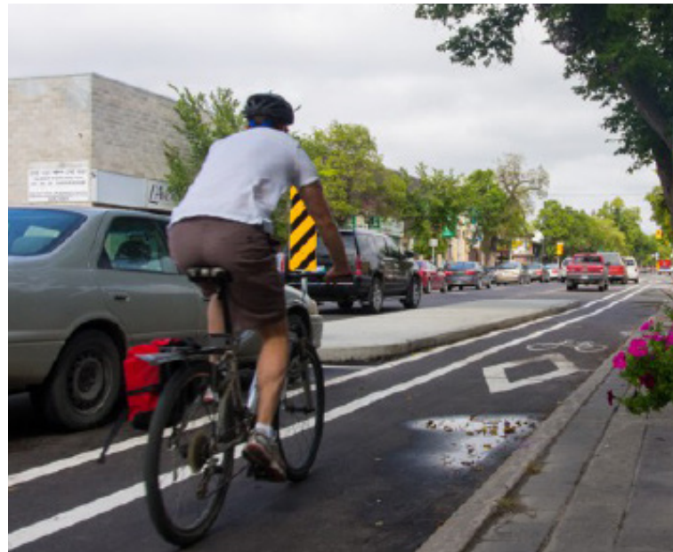
FIGURE 2 | Cyclist on Sherbrook Avenue

Based on the belief that the loss of a single life on our roadways is unacceptable, Vision Zero is a leading traffic safety strategy with an overall aspiration of zero serious injuries or fatalities. The philosophy of Vision Zero states is that “the chain of events that leads to a death or disability must be broken, and in a way that is sustainable, so that over the longer time period loss of health is eliminated” (WHO 2015, 20). By taking a systems approach to enhancing safety, Vision Zero shares the responsibility for human safety with the overall system design by addressing infrastructure design, vehicle technology, and enforcement.