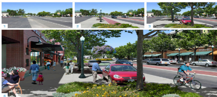
FIGURE 7 | Complete Streets possibilities

Unsafe speeding is a leading contributor to fatalities and major injuries. This report recommends that Winnipeg continue implementing street designs that reduce dangerous speeding. The transportation department should continue to work closely with the Police department to develop enforcement strategies that stem excessive speeding and set targets for reducing excessive speed. Through the pilot study with the MPI, the Winnipeg Police Service and CAA Manitoba, the department of Transportation is now in the process of identifying the city's most dangerous streets and intersections and redesigning them to curb dangerous speeding and improve safety (MPI 2016).