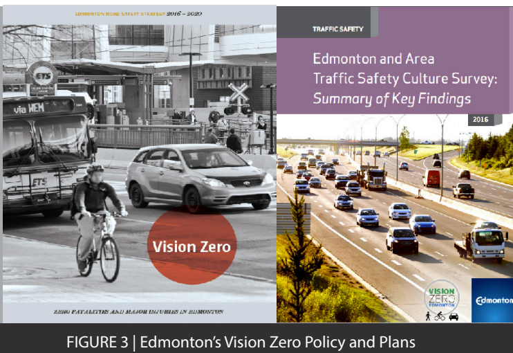
FIGURE 3 | Edmonton's Vision Zero Policy and Plans

As stated in the Strategy, "the demand for greater efficiency and effectiveness in road-safety resource use and management requires the use of an evidence-based principle and rigorous evaluation" (11). Edmonton established and utilized the Urban Traffic Safety Research Chair to "evaluate ongoing state-of-practice transportation-related initiatives and develop state-of-art methodologies and practices" (ibid.). Similarly, a Law Enforcement Research Chair was created to