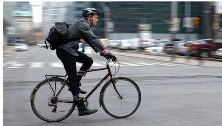
FIGURE 6 | Bike Advocates have Rallied around Vision Zero

While Winnipeg does not have a council approved road safety strategy system in place, it does have several policies and plans that reflect Canada’s Road Safety Vision. Winnipeg’s Transportation Master Plan (2011) speaks to “safe, efficient and equitable transportation for people, goods, and services” (3). Our Winnipeg’s Complete Streets includes aims to make streets safer through road narrowing, on-street parking, bicycle lanes, bus lanes, sidewalk expansion, streetscape, and speed limit reduction - all of which are consistent with Vision Zero policies.