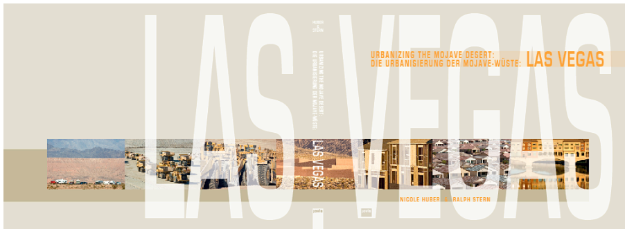
Cover (back & front)