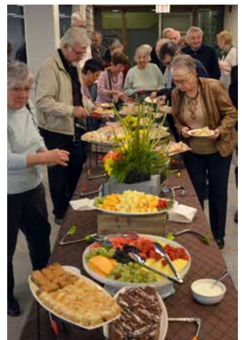
Retirees line up for delicious snacks at fall Reception.