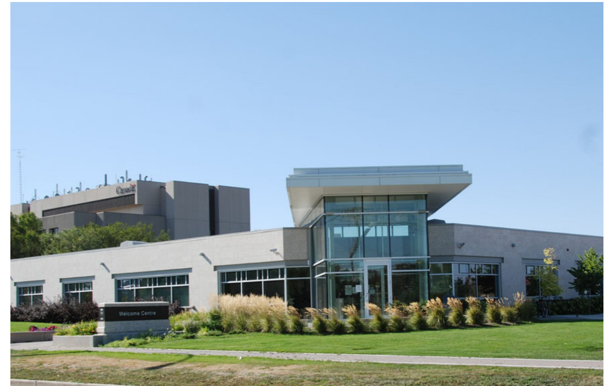
Welcome Centre 423 University Crescent

https://umanitoba.ca/campus/security/programs/index.html