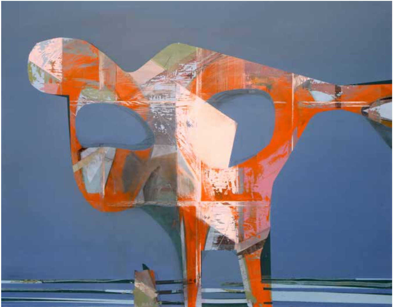
Kalberg, Prop 3