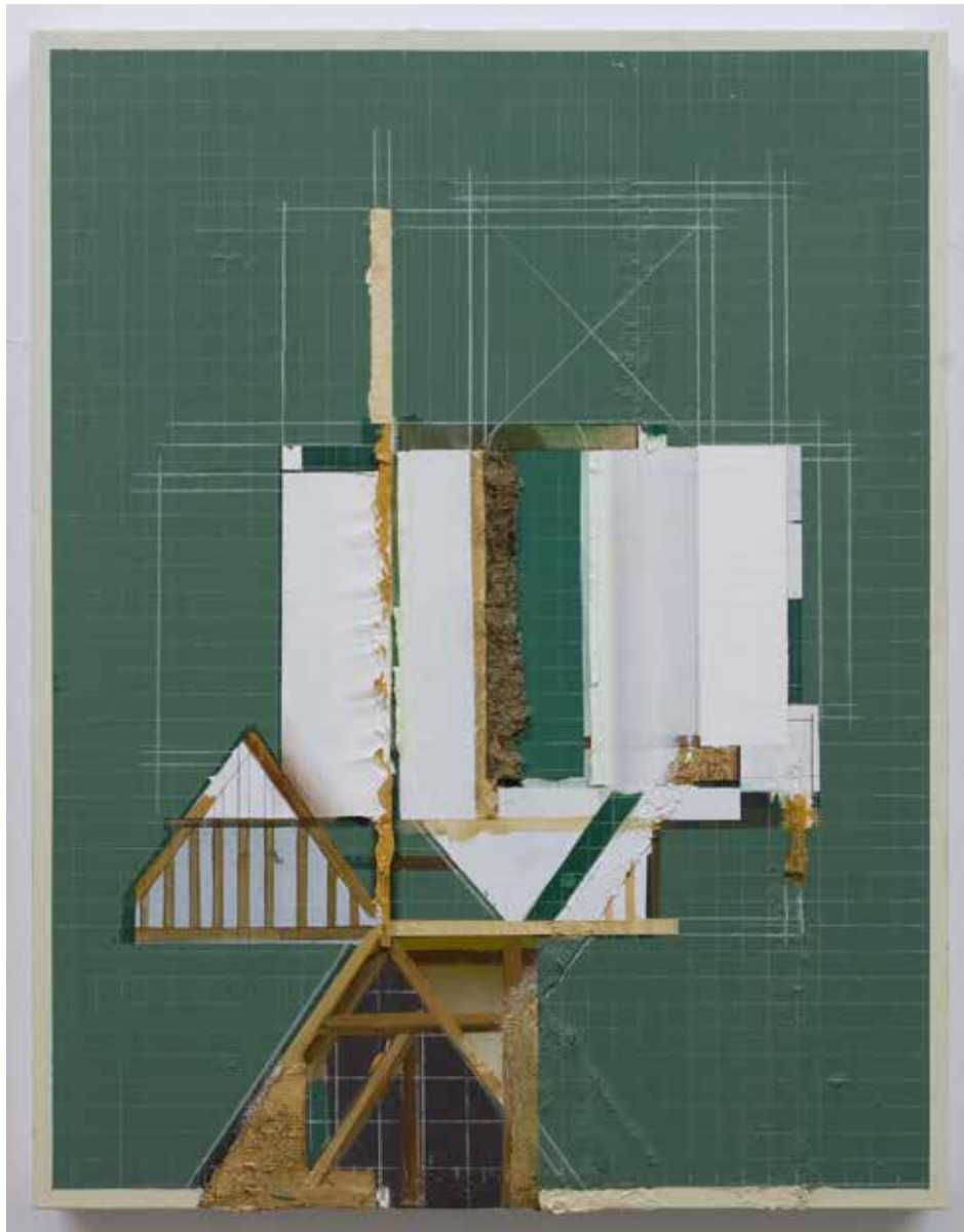
Hildebrand, A Small Distinction