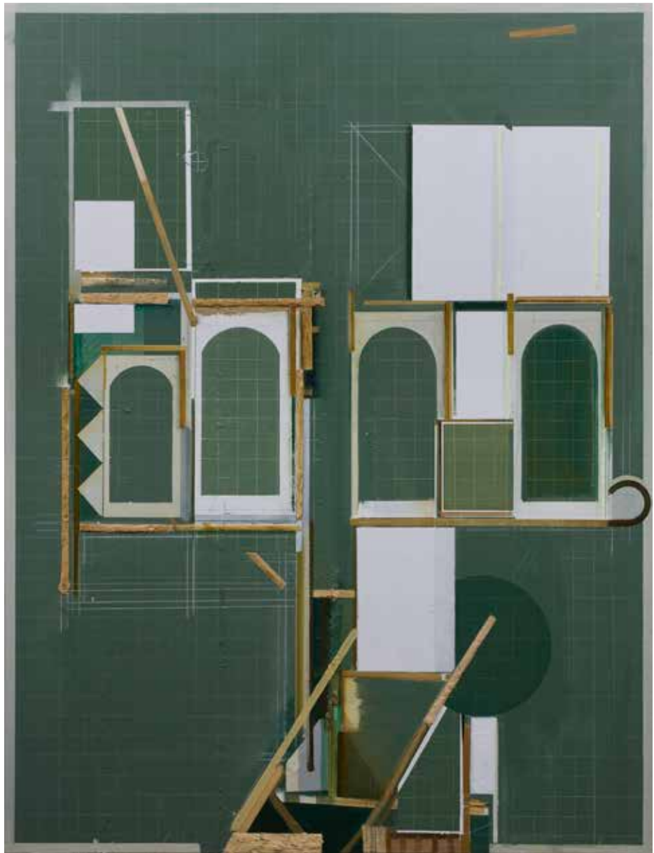
Hildebrand, Domestic Arrangement