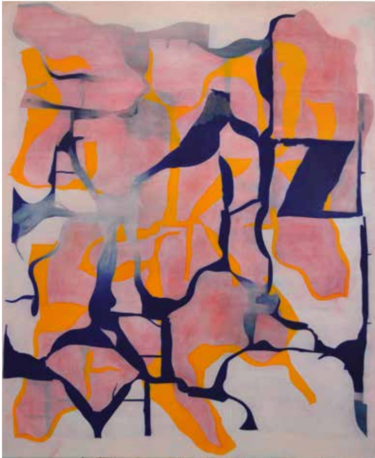
Kaktins-Gorsline, Todd Glass