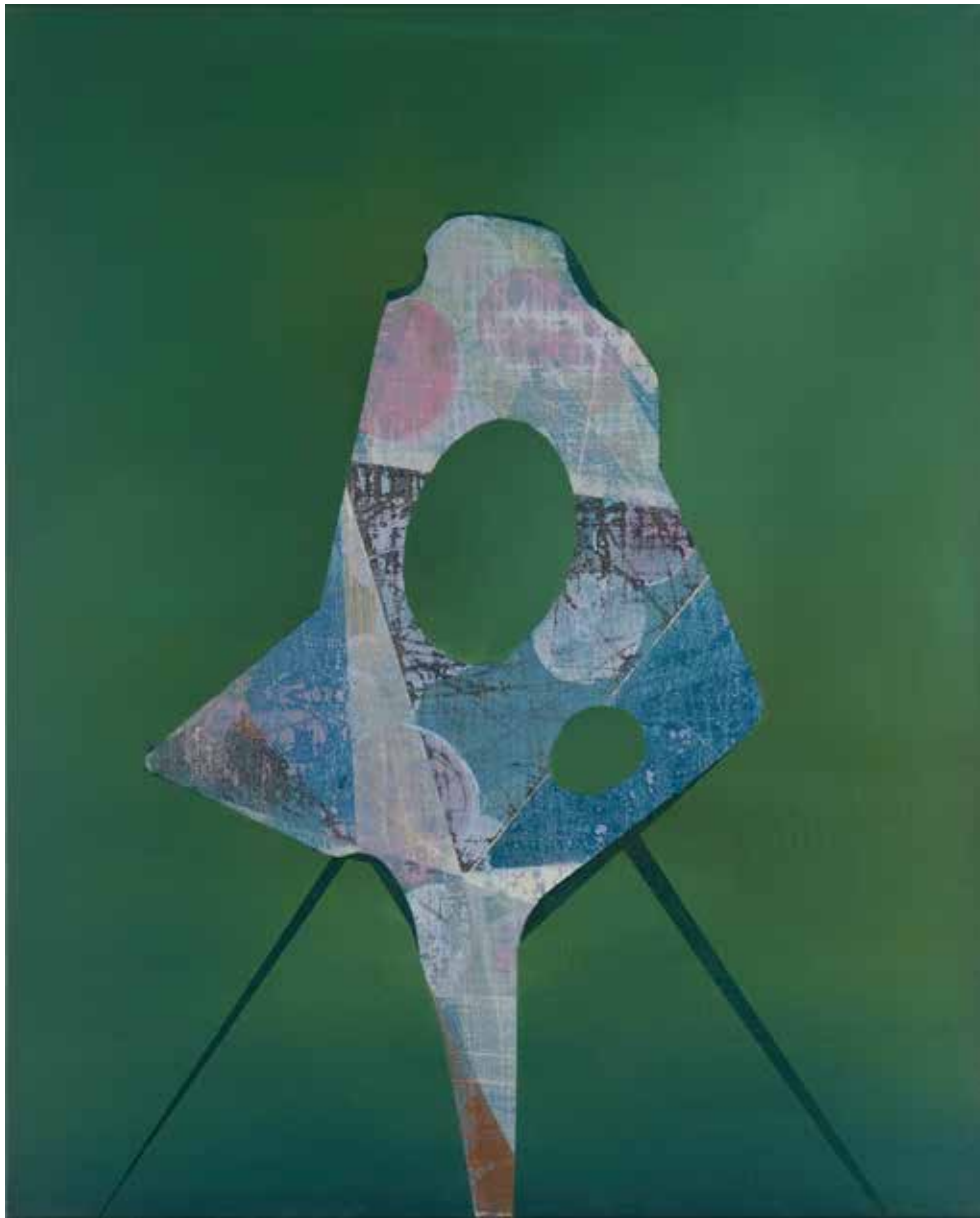
Kalberg, Prop 1