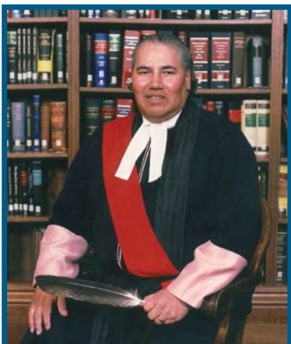
Mr. Justice Murray Sinclair