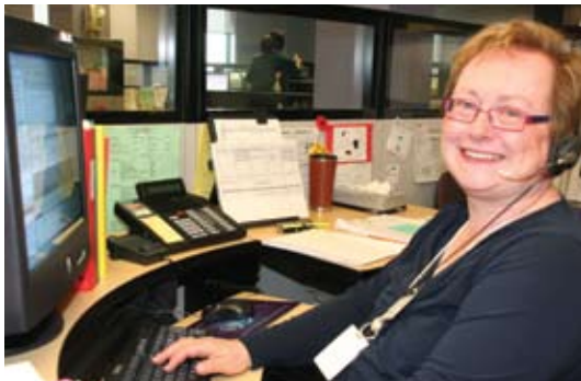
Nurses are available 24/7 to respond to any heart failure questions you may have