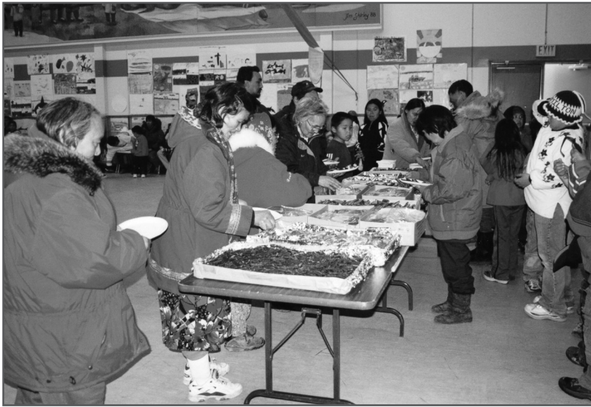
Traditional community feast in Rankin Inlet, Nunavut.

Traditional knowledge or traditional ecological knowledge is a body of knowledge built up by a group of people through generations of living in close contact with nature. The working definition we have used for traditional ecological knowledge is “a cumulative body of knowledge, practice and belief, evolving by adaptive processes and handed down through generations by cultural transmission” (Berkes 1999: 8). We use the term indigenous knowledge and traditional knowledge in the broader sense to mean knowledge specific to an area or culture, and traditional ecological knowledge when the knowledge is of ecological nature (not all traditional knowledge is). These are dry definitions compared to what Aboriginal people themselves have to say about traditional knowledge. For example, when native participants in a conference in Inuvik were asked to describe traditional knowledge, there was consensus on the following meanings: practical common sense; teachings and experience passed through generations; knowing the country; rooted in spiritual health; a way of life; an authority system of rules for resource use; respect; obligation to share; wisdom in using knowledge; using heart and head together.