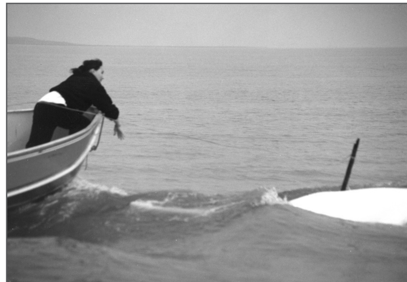
Inuvialuk woman harpooning a beluga whale near East Whitefish Station in the Mackenzie Delta. Photo by Fisheries Joint Management Committee, 1998.

In the broadest sense, indicator is a general term that is used to denote a relatively simple signal of complex trends and conditions or states, often