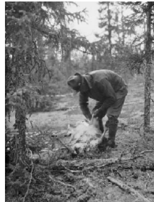
Chippewyan indian skinning caribou, 1882

In the winter of 1982/83, large numbers of caribou appeared for the first time in the lands of the Chisasibi Cree, validating the elders’ predictions. The first large caribou hunt of the century took place the following winter, but the result (according to Chisasibi elders) was disastrous. Large numbers were taken, not necessarily a bad thing, but many hunters were shooting wildly and without restraint, killing more than they could carry. According to the Cree worldview, hunters and animals have a reciprocal relationship based on respect, and Chisasibi elders were worried that hunters’ behaviour signaled a lack of respect for the caribou.