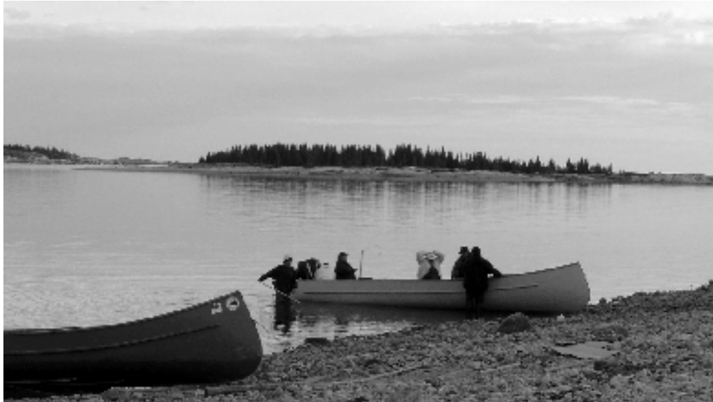
James Bay Cree people of Wemindji, Quebec, Canada, on a summer camping trip.

The ability or capacity to learn from small and incremental lessons, and from the experiences of others, potentially enables people to develop sustainable practices and ecological understandings without always having to respond to and learn from crisis situations. Not only an event itself, but any inferences, extrapolations or interpretations people draw from it, can be enfolded into an enriched, elaborated system of knowledge and practice. Over time, even within one lifetime, experiences of others blend with personal knowledge and observations, compounding and