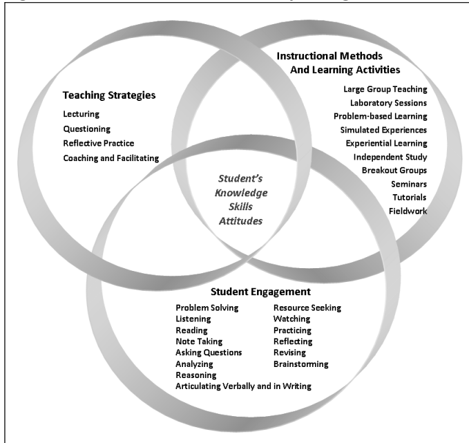
Figure 3: Educational Elements Impacting Student Learning

Figure 3 summarizes the three elements noted above (i.e. teaching strategies, instructional methods and learning activities, and student actions) that interact to transform students’ knowledge, skills and attitudes. Active engagement of students is of paramount importance in their learning and in their development as professionals.