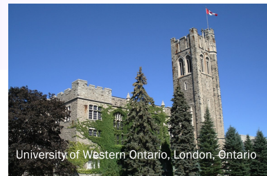
University of Western Ontario, London, Ontario