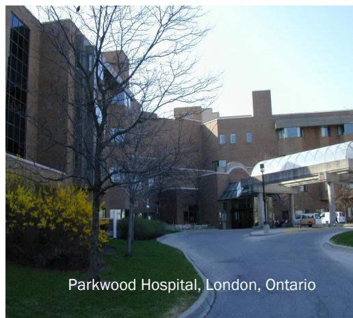
Parkwood Hospital, London, Ontario