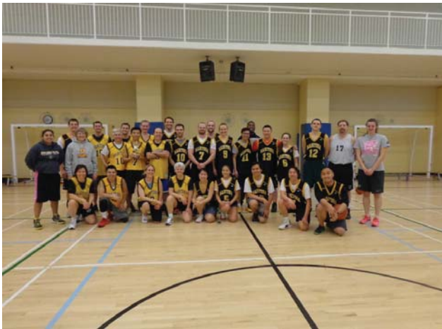
3rd Annual Staff vs Students Basketball teams