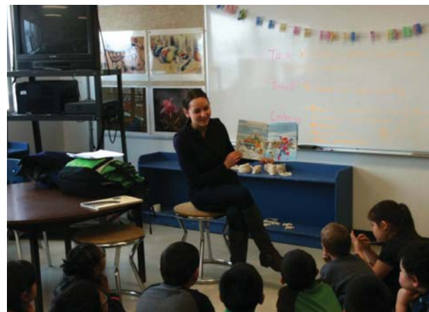
“I Love to Read” month volunteer reading to student