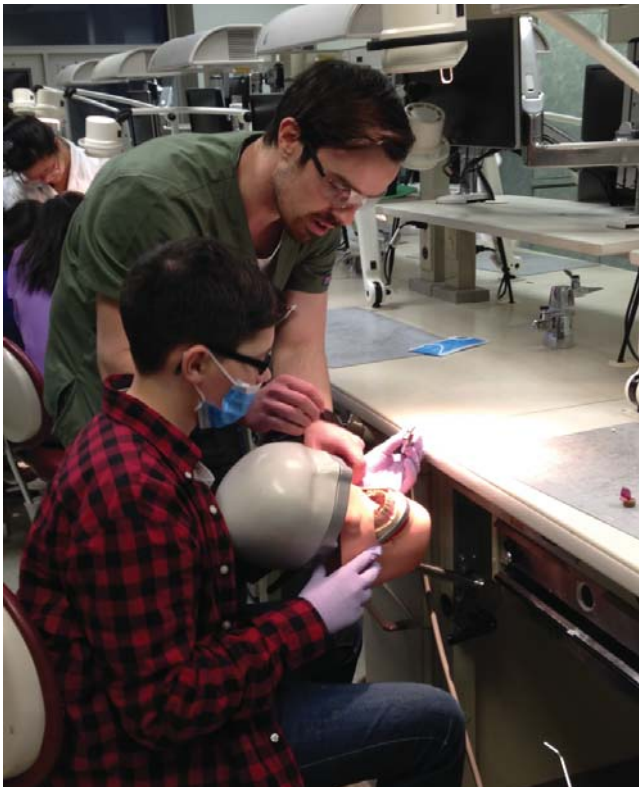
CanU - REACH program