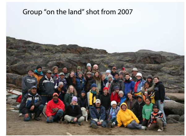
Group "on the land" shot from 2007