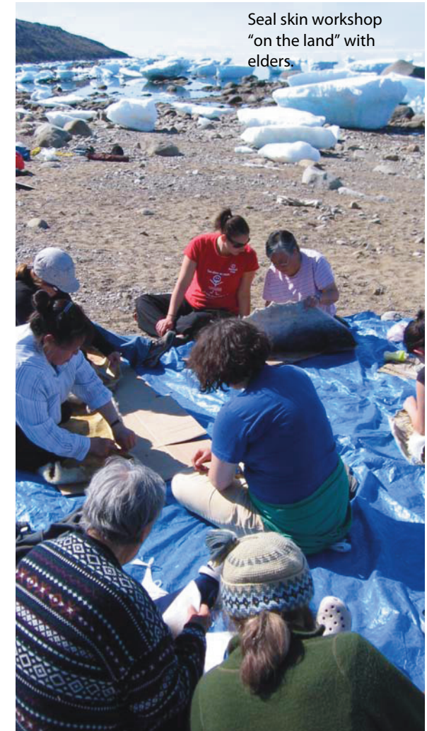
Seal skin workshop “on the land” with elders.