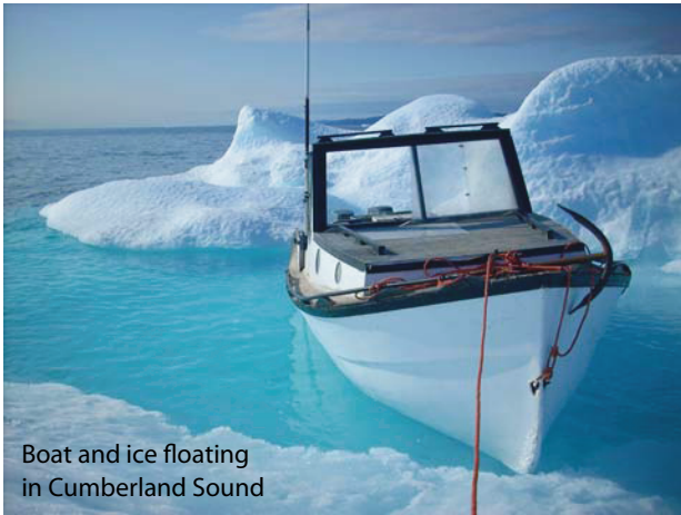
Boat and ice floating in Cumberland Sound