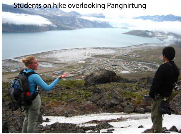
Students on hike overlooking Pangnirtung