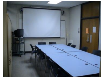
103C Isbister - Seminar Room

The Resource Room located in 103B Isbister stores all the Language Centre's Resources. It includes DVDs and Blu-Rays, VHS tapes, CDs, books, and games from the different languages taught in the Faculty of Arts. Resources can be set aside ON RESERVE for the length of the term to make sure students can view the films in the Resource Room. Students can view films on the computers or on the television in the Resource Room during regular office hours.