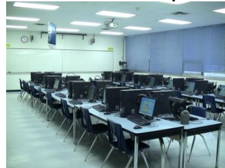
102 Isbister - 30 Computers