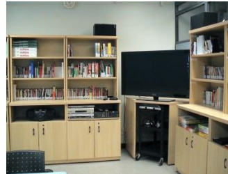
103B Isbister - Resource Room

The Language Centre sound booth is used for recording clear audio for course content, tests and/or exams.