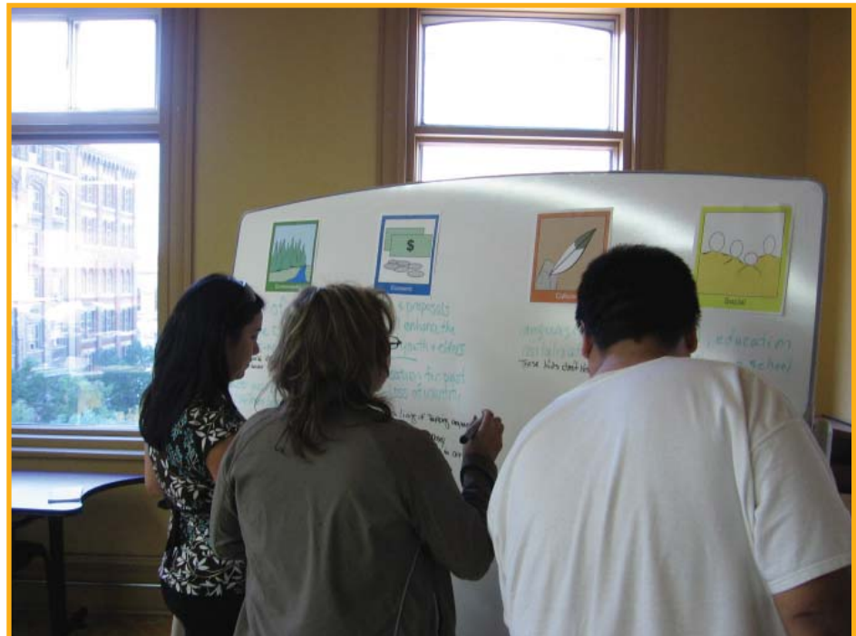
Participants identify issues to be addressed by the CCP process.

The Centre for Indigenous Environmental Resources (CIER), located in Winnipeg, MB, is a non-profit organization. Its focus is to