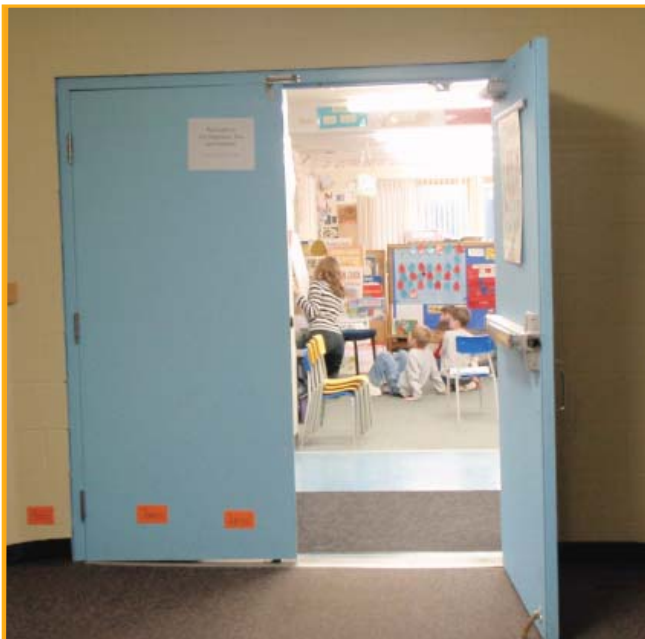
Working with students in Simpcw First Nation.

with seven First Nations from Manitoba and Ontario on the CCPs. It will continue with the same approach of building capacity for the local planners and the First Nations, even as the program is adapted to meet the hopes and needs of this new group. In addition, CIER is incorporating this approach into its proposals for its work with First Nations on land use planning and climate change adaptation planning. As the program continues to be adapted and refined each time it is offered, it is hoped that it will continue to benefit and support First Nations in creating and implementing their community visions and sustainability plans for the long term.