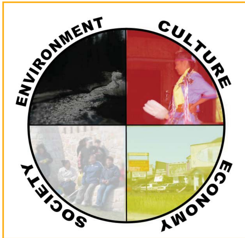
The CCP Sustainability Wheel

to develop its ‘environmental excellence vision’ as a means of prioritizing its own work and actions. To gather this information, CIER staff visited 130 First Nations and 50 Aboriginal organizations across Canada from 2004-2006. CCP was overwhelmingly identified as a governance priority for First Nations. Information about the CCP support program was shared through advertisements in Aboriginal newspapers and on the CIER website; forty First Nations indicated that they would be interested in participating in the pilot course.