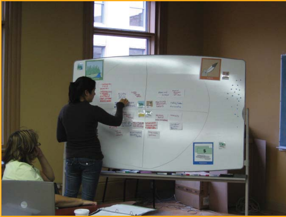
Using the Medicine Wheel to discuss community sustainability.

of developing the plans are so different in each community, the final plans will not all look the same.