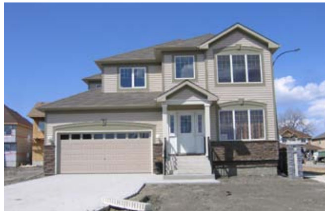
Example of single-family detached home in Bridgewater Forest.

Increased density is a significant component of improved urban design and has been identified in the objectives of Waverley West. The estimated number of residents for Waverley West upon completion is 40,000 people. It has been assessed that approximately 1,740 acres will be used for residential development, of the 3,075 acres that make up Waverley West. When the calculations are made, this means that there will be on average 23 people per acre. Typical suburban developments often have four dwelling units per acre, and today, house 2.5 people on average (Land Use Study, 2004). These numbers show that it would require 5.75 people per household in order to fulfill the projection of 40,000 people.