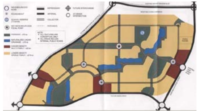
Layout of Northeast Neighbourhood (Northeast NASP, 2006)

The Northeast ASP was developed through consultation with landowners, existing residents, adjacent neighbourhoods, and interested citizens.