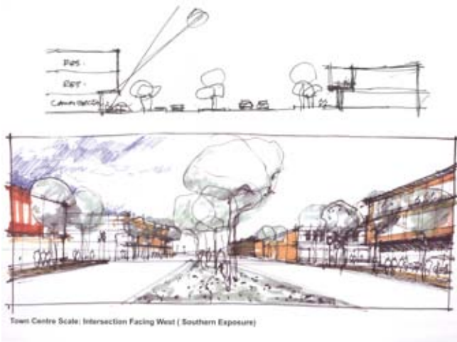
Town Centre design sketch (Southwest Fort Garry Design Charrette 2003)

The project has received substantial coverage in the media and has become a controversial topic gathering both praise and criticisms. Several features of the project indicate that steps have been made towards developing a better suburb. Critics argue, however, that while steps in the right direction have been made, there is still plenty of room for improvement when it comes to innovative suburban development. The following discussion will show how the policies have shaped the design strategies.