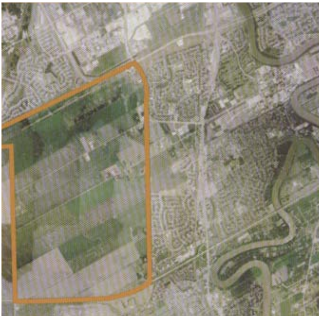
Waverley West boundary amidst south end neighbourhoods (Southwest Fort Garry Design Charrette, 2003)