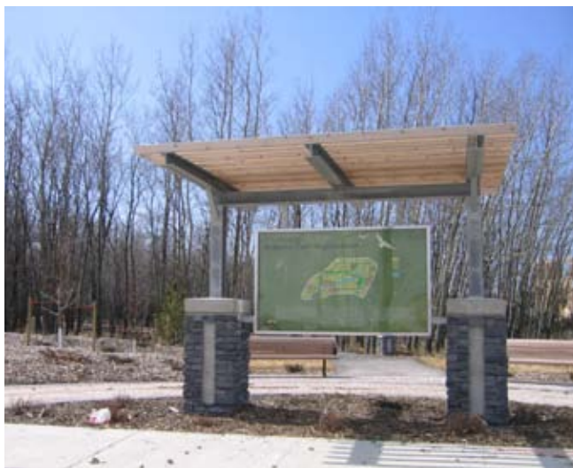
Public education board, describing features of the neighbourhood.