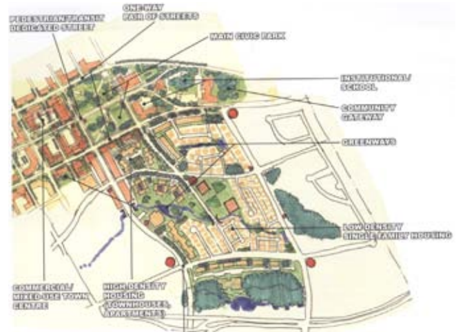
Sample Plan from (Southwest Fort Garry Design Charrette, 2003)

The goals of the charrette were to explore possible design solutions for the Waverley West development based on the questions: "How would contemporary propositions about New Urbanism, walkable neighbourhoods and more sustainable urban development, 'translate' on the ground at this site?" "What would it look like?" And, "what is possible in this place, with its particular limitations and opportunities?" Three teams each came up with proposed solutions for the future development of Waverley West based on Smart Growth, and other innovative planning solutions (Southwest Fort Garry Design Charrette, 2003).