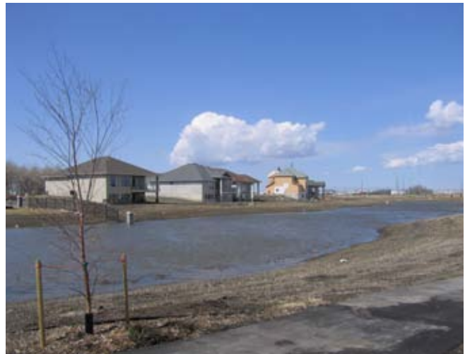
lake/drainage system in Bridgewater Forest.

Natural land drainage systems have been incorporated into the Northeast neighbourhood, however little is explained in the ASP or Northeast NASP that defines what system is used, or explains the benefits of such a system.