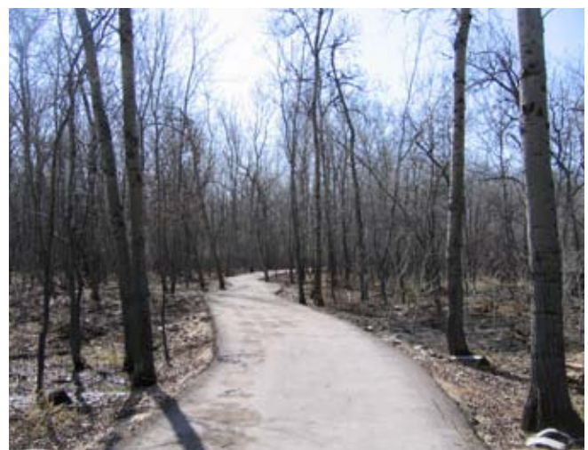
Forest preserve, with pathway in Bridewater Forest neighbourhood

Because the word sustainable does not appear in the ASP or NASP does not mean that sustainable design features will not exist in Waverley West. The Northeast Area Structure Plan indicates several environmental features will exist in the neighbourhood. For example, thirty acres (or about 10%) of the neighbourhood will preserve and integrate an existing aspen forest that acts as a carbon sink, reducing carbon emissions in the atmosphere.