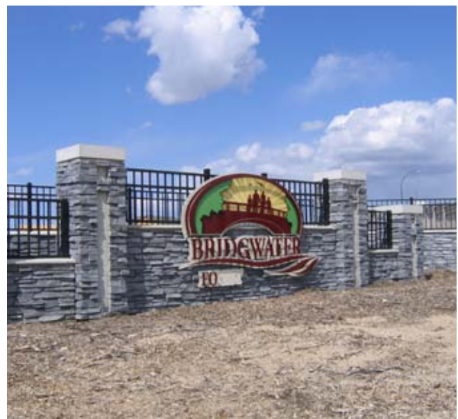
Entrance Sign to Bridgewater (First Neighbourhood phase)

April, 2009, construction continues on the first neighbourhood phase, now known as Bridgewater Forest. Approximately 100 houses have been constructed.