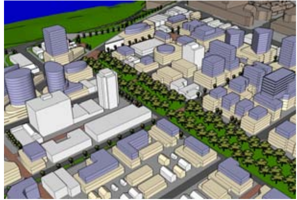
The Armature provides open recreation and gathering space with mixed-use development fronting the park.

Through mixed-use zoning, The Quarters will support economic diversity through a range of employment and shopping opportunities for visitors and residents of all income levels. For winter cities like Winnipeg, providing more commercial space throughout a neighbourhood would also allow citizens to warm up and make longer walks more bearable. The City of Winnipeg has only recently begun to implement mixed-use zoning in parts of Downtown. It would definitely be beneficial to expand mixed-use zoning to other neighbourhoods and Pembina Highway. On the other hand, key urban design considerations such as building placement and façade treatment are only encouraged and not currently required in Winnipeg Zoning By-laws. Furthermore, the