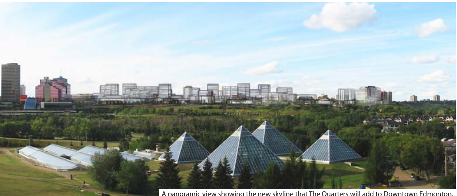
A panoramic view showing the new skyline that The Quarters will add to Downtown Edmonton.

From the start, it is important to create a strong vision that can be referred to, especially in times of uncertainty. The Vision for The Quarters provided clear guiding principles and implementation strategies to ensure that the plan did not stray away from its goals.