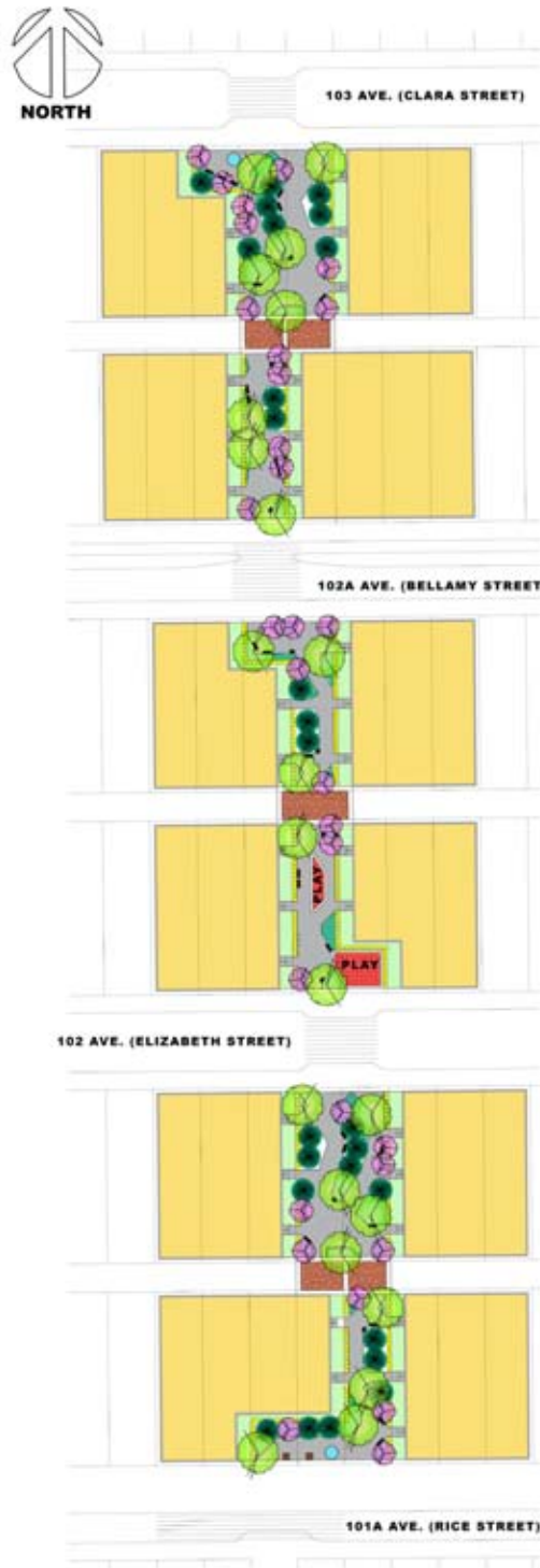
Flexibility in acquiring available lots and setback requirements has resulted in more interesting non-linear pathways through neighbourhood blocks with opportunity for landscaping and spaces for activity.