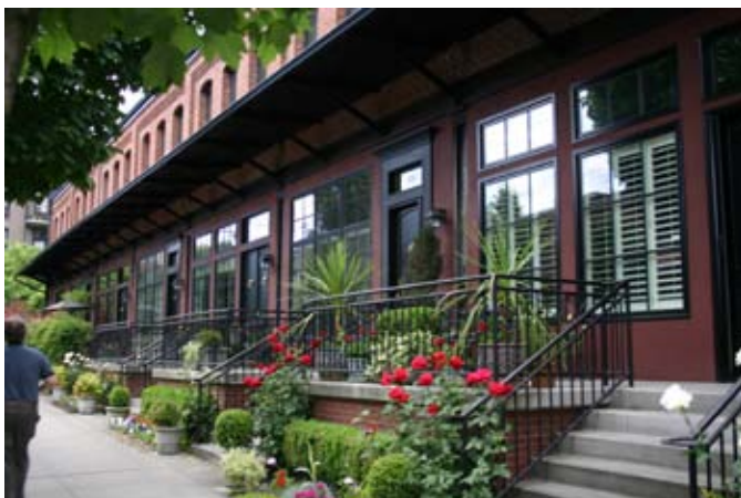
New townhousing development will soon be fronting onto existing back lanes in The Quarters

By far the most significant public space in The Quarters is The Armature: the creation of a large four block open space with mixed-use buildings fronting the park. This space provides outdoor recreation for the neighbourhood with play space, informal gathering space, and programmed space. Some mixed-use development will occur directly on the Armature to add additional programming and activity to the park. On a smaller scale in Winnipeg, the large medians along Broadway are often overlooked. Given the number of people that work and live in Downtown, these underused and poorly maintained medians may benefit from similar programming and activity in The Quarters. Consideration can also be given to