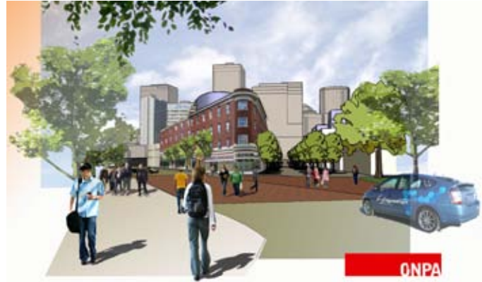
The combination of new paths, streetscaping design, and a significant decrease in surface parking will contribute to a more walkable pedestrian-oriented neighborhood in The Quarters.

The existing number of parking spaces in The Quarters will be significantly decreased to further encourage the use of active and public transportation. In fact, the new Sobeys grocery store in Downtown Edmonton has provided no parking space and caters specifically to those who work or live in downtown. Where needed in The Quarters, environmentally appropriate parking structures are to be constructed with preferred parking provided for car-sharing and alternative-fueled vehicles. In addition to these considerations, Downtown Winnipeg may look to higher parking costs to deter citizens from driving. Additional revenue from parking may help to fund streetscaping initiatives. Currently Winnipeg has some of