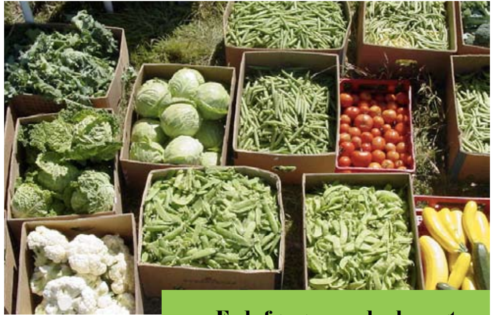
End of season garden harvest

There are many benefits related to community gardens including; environmental, health, economic and social. They not only can provide a source of fresh,