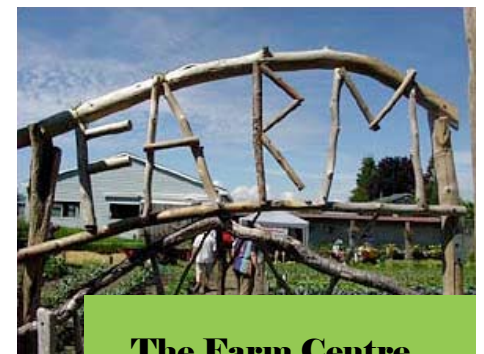
The Farm Centre