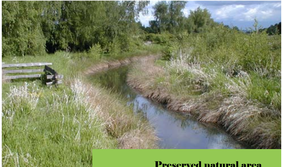
Preserved natural area

In response, the Save Richmond Farmland Society was formed. This group of concerned citizens knocked on thousands of doors, raised public consciousness and mobilized the community to preserve Terra Nova as valuable farmland, important wildlife and marine life habitat and vital open park space. The battle over the Terra Nova lands was fought several times over the years, including an appeal in the Supreme Court of Canada and in the 1990 municipal election in which new councillors were voted in based on their support for saving the land. For many years, this society served as the community's voice in regards to changes in land use.