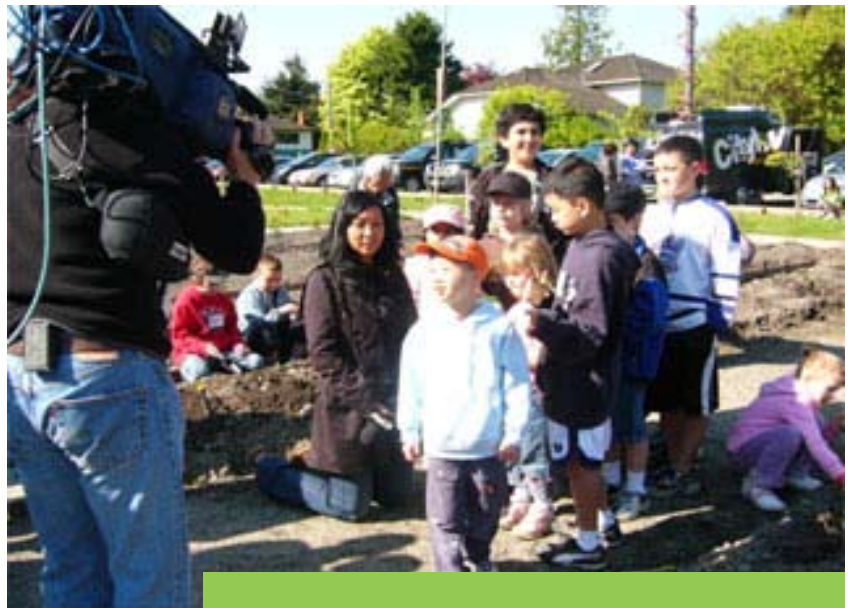
Schoolyard project children

There are multiple learning outcomes and extensions that are achieved by this project. Some key outcomes include social responsibility, science, math, wellness and cooperative learning. Not only has city owned land been dedicated to a Demonstration Garden, 100 individual community garden plots, a school food security project, and a 2.5 acre active farm, but all the produce grown is donated to the regional Food Banks.