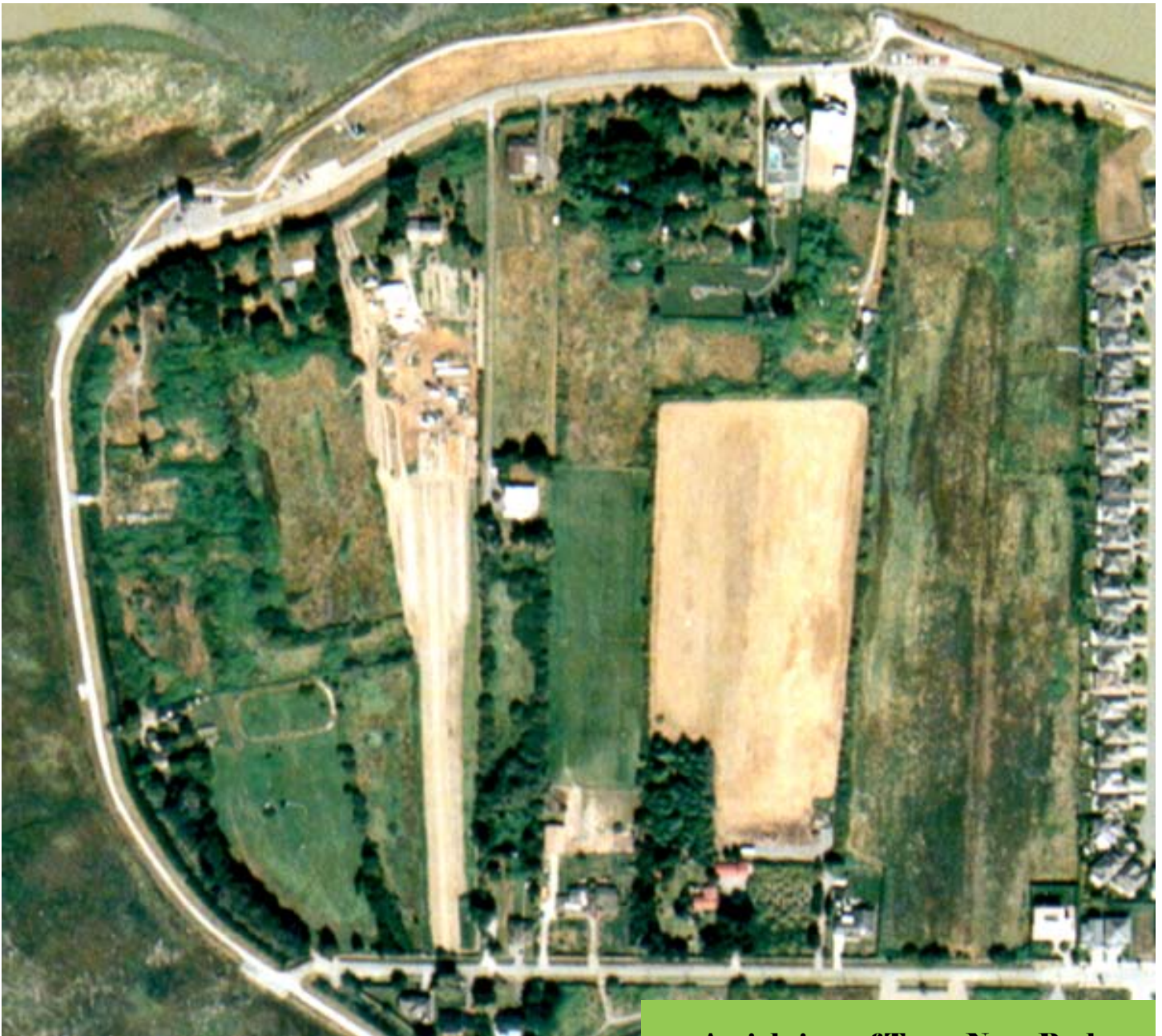
Aerial view of Terra Nova Park