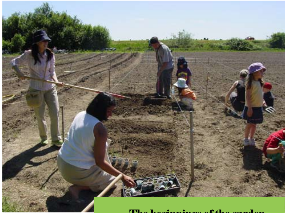
The beginnings of the garden

The value of Terra Nova Park with its significant environmental, heritage and recreational assets was recognized by of the provincial government and the Government of British Columbia which contributed $2 million to assist with the development of the site.