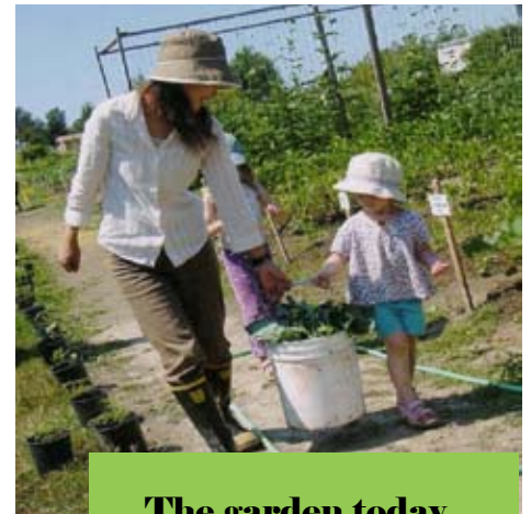
The garden today

It is this diversity of landscapes on the site, from natural growing hedgerows, fields of grass to the individual vegetable plots to the more formal demonstration garden that make this site so diverse and interesting to the public.