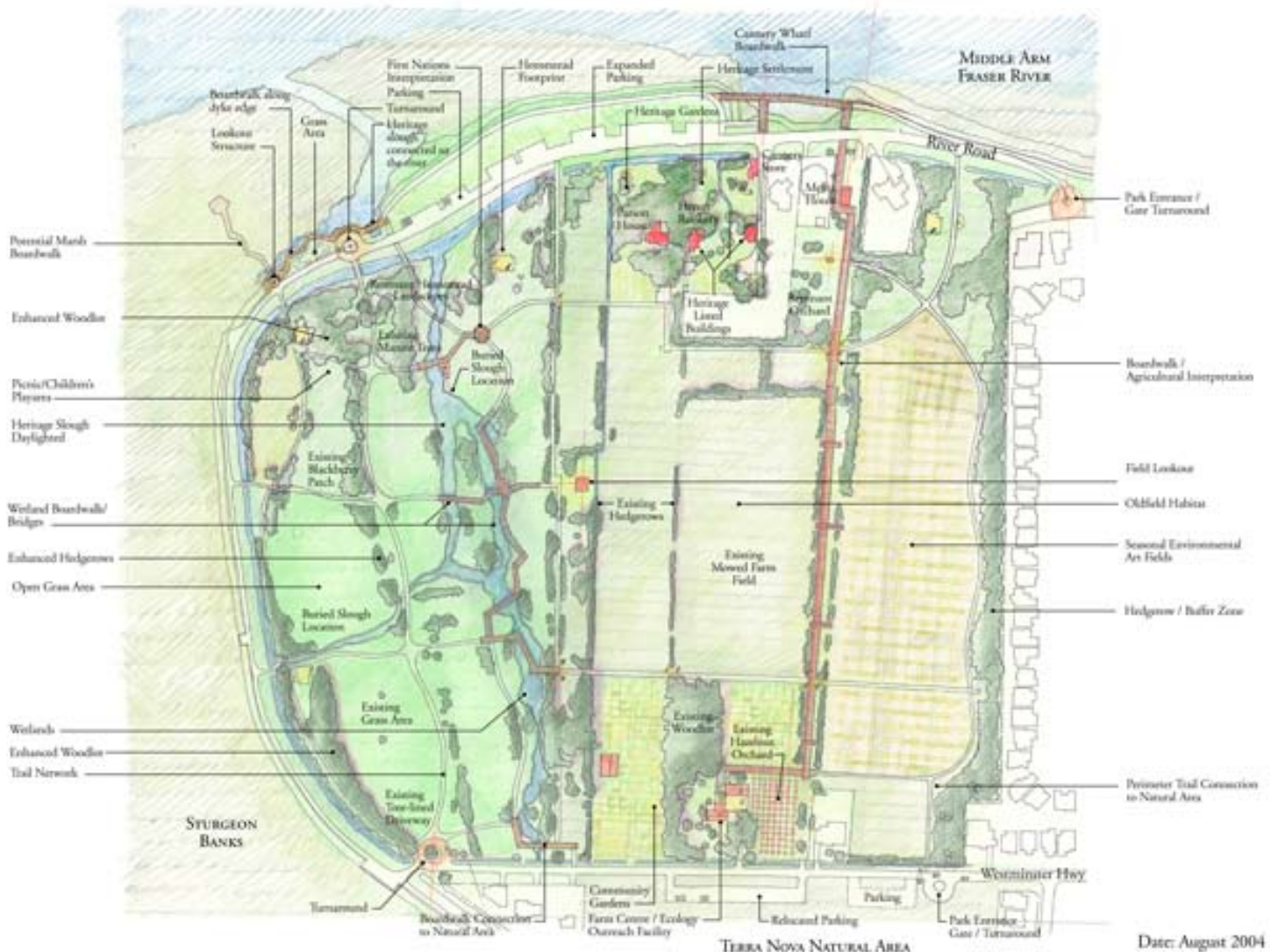
Terra Nova Park Concept Plan

The open houses were well attended and the community feedback was very positive. The support for the park plan was the highest the City of Richmond Parks Division had ever received for a park plan with 98% of the people strongly supporting the planning principles, and the park vision: "to preserve the unique rural character while providing a balance between agricultural heritage, wildlife conservation, and recreational uses."