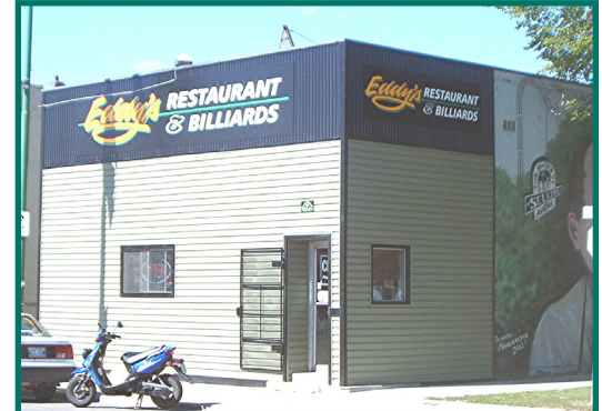
Eddy's Restaurant & Billiards, Before and After Photos, North End Storefront Improvement Grant Project.

2. The Aboriginal Youth Business and Money Management Project is administered by SEED Winnipeg. This project aims to increase economic development opportunities and services for North End Aboriginal Youth through introductory economic and business development skills workshops for youth aged 16 to 30 years.