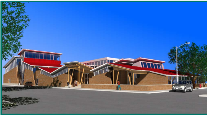
Proposed Design of North End Wellness Centre.