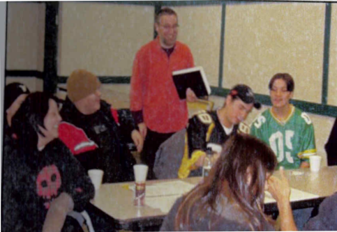
BridgmanCollaborative Arch. Grand Rapids.

Unique community needs specific to the socio-economic composition of each individual community could be better addressed locally. There is no standard community participation model that fits all that addresses the local and the regional community issues in concert. In the case of Grand Rapids, it is an area situated in a critical geo-political and cross-cultural location that reveals new planning challenges. It also creates an opportunity for a new planning imagination and community participation model to emerge that responds to the specific needs of the region.