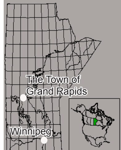
Map of Grand Rapids Area