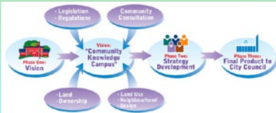
Three Phase Future School Site Study Process

less of wish and more of a necessity. They take into account economies of scale, mitigate against decreases in peak student generation and help ensure that future developments have a central focus. Vacant school sites are not