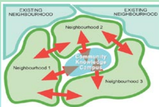
CKC centrally located with links to new and existing neighbourhoods

Phase two of the study dealt with creating a strategy to bring the shared vision into reality. Committee representatives emphasized the value of a co-operative planning initiative by underlining its effect on shared costs, effective community design, and efficient access to public parks and sports fields. In order to create a viable CKC model, the committee needed to identify societal trends, research provincial legislation, and review land use policies. A framework of factors, which influence school site decision-making, was drafted to guide the development of the CKC model.