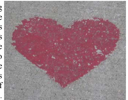
Seven Oaks Hearts in Motion Trail Marker. Every 100 metres, trail users will see painted hearts on the ground marking the trail.

Public health has been in the news to an alarming extent in the recent past. The issues covered include obesity (child and adult), increase of Type 2 Diabetes in youth, child hypertension, and many other illnesses related to inactivity of the population. Some of the reports lay blame (if not wholly, at least in part) to poor urban planning with lack of access to walkable communities and neighbourhoods. Public health has been written up in a number of books alongside of urban planning, in particular, issues with sprawl. Within these books, there are possible solutions presented, among them listings for healthy community movements and sustainable developments.