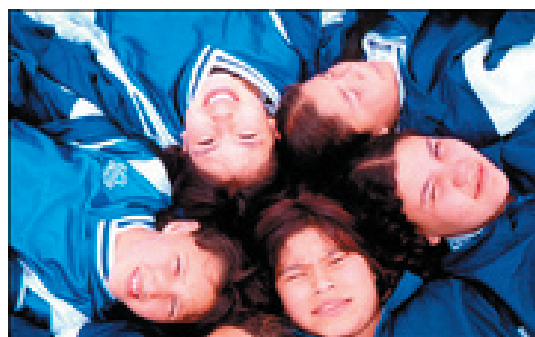
Aboriginal people are involved in all facets of city life