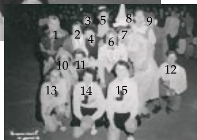
1954 FRESHIE PARADE: