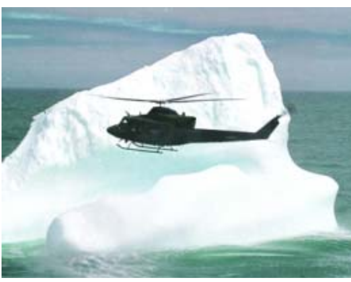
CH-146 Griffon.

This fleet also offers the best example for using a domestic priority for overseas missions. Even at roughly sixty opera-