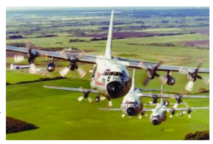
CC-130 Hercules.

The apparent government priority to invest in these capabilities stands in stark contrast to the relative vagueness and ambiguity to which national requirements are treated, especially vital territorial surveillance and reconnaissance, and access to the North needs. This is disconcerting not least of all past White Papers, such as 1971 and 1987, are littered by such promises which never materialized into actual capabilities.