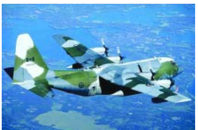
CC-130 Hercules.

Ceding missile defence to our ally and ignoring outer space implies a decision to