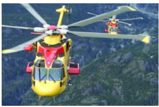
CH-149 Cormorant.

It is clear that the proposed direction of the CF is truly transformative. If carried out, the CF will become a limited role, combat force (niche to use an unpopular term), with its combat core consisting of relatively small elite land forces. The other environments are to be assigned a support function, although they will still possess,