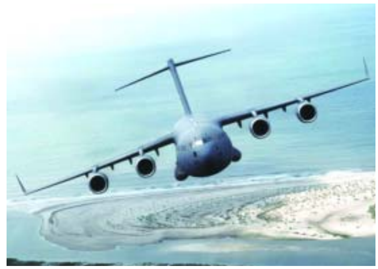
C-17 Globemaster III.

In pursuing this path or vision of the future, such a capability will ensure that the CF remains inter-operable and a valued contributor to international campaigns. But, this vision places precision strike (aerospace) capabilities in the hands of allies and coalition partners, and it is in this sense that the future is absent in aerospace discussions, notwithstanding references to the acquisition of an air-to-ground weapon's system for the CF-18.