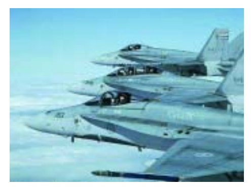
CF-18 Hornet.

Indeed, the DPS does not even engage the debate of manned versus unmanned aerial combat vehicles, even though it is being closely monitored by the Air Force and others. Instead, unmanned aerial vehicles are strictly limited to surveillance and reconnaisence functions.