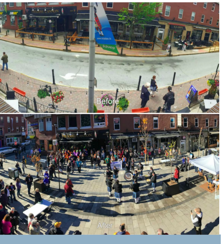
Figure 3: Before and after view of the streetscape project (CBC news, 2017)

and identify any potential issues before implementing it on a larger scale. Overall, the community engagement efforts ensured that the project was inclusive, accessible, and beneficial to the community.