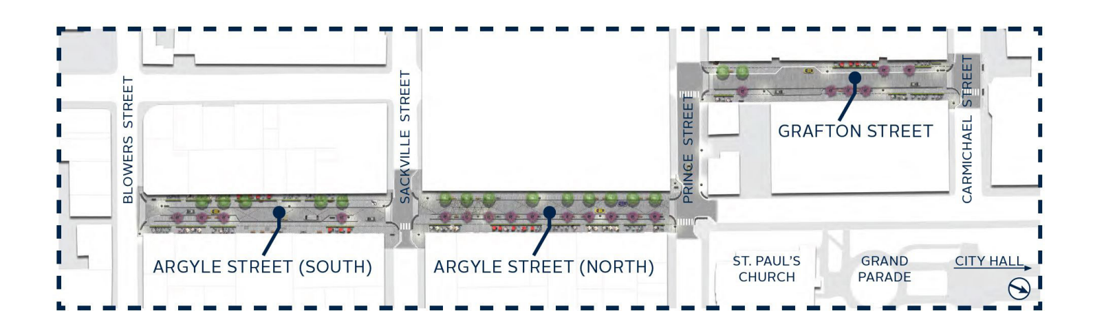
Figure 1: Argyle and Grafton site plan (Personal Communications, 2023)

The concept of shared streets emphasizes the dual functionality of roadways as they operate as both a transportation route, as well as a space for pedestrian socialization and activity (Ben-Joseph, 1995). By creating a shared space for all modes of