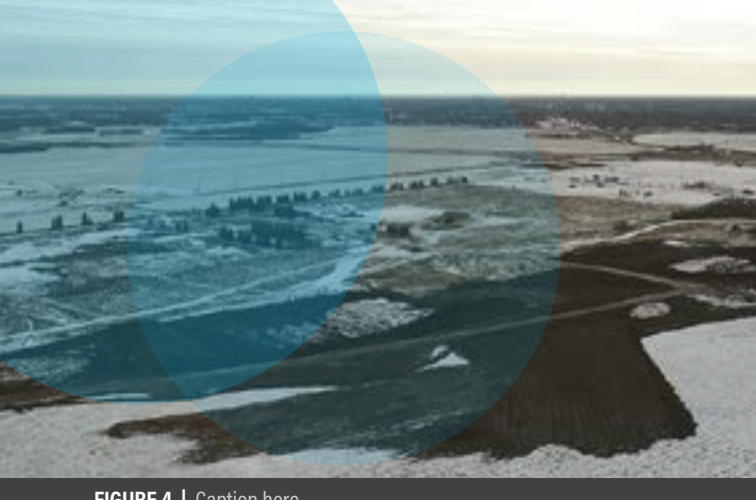
FIGURE 4 | Caption here

The biosolids fabricated soils could promote vegetation establishment and can be used in a variety of municipal contexts such as roadside plantings, gardens, and parks. In addition, the soil fabrication will restore the landfill to native prairies landscape (City of Winnipeg, 2020).