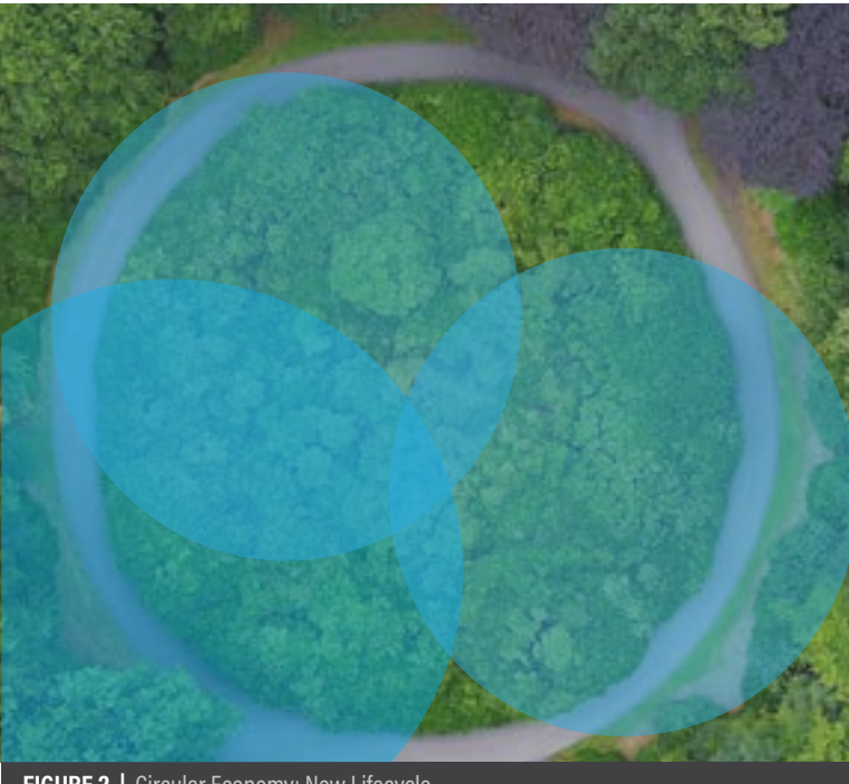
FIGURE 2 | Circular Economy: New Lifecycle